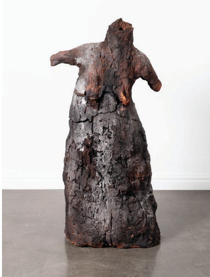
Johann Louw Tannie Sarie op Vanzijlsplaas 2019 Kiln Fired Clay & Ash 80 x 40 x 31 cm

b. 1965, Belville, South Africa. Lives and works in Cape Town, South Africa.