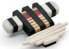
Carine Terreblanche You Can't Heal Under a Mask I 2020 Porcelain, Wood, Resin and Silver Brooch 4.5 x 5.5 x 1.4 cm