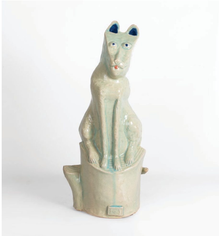
Hylton Nel Dog on stump 2019 Glazed Ceramic Stoneware 45 x 20 cm

Lives and works in Calitzdorp, South Africa.