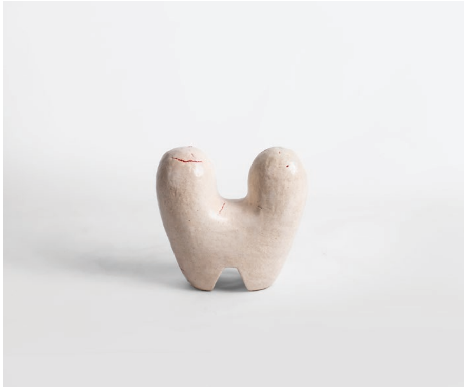
Carine Terreblanche Love is a Sickness Cured by Time 2019 Stoneware Clay and Enamel Paint 12.5 x 13 x 6 cm