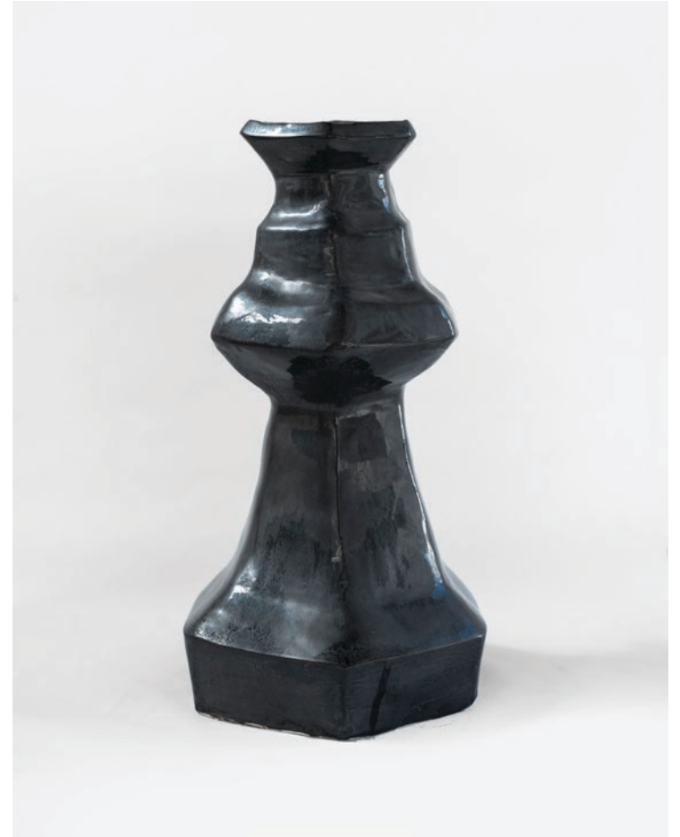
Eva Shuman Lord Sword 2020 Glazed Earthenware 47 x 23 x 25 cm