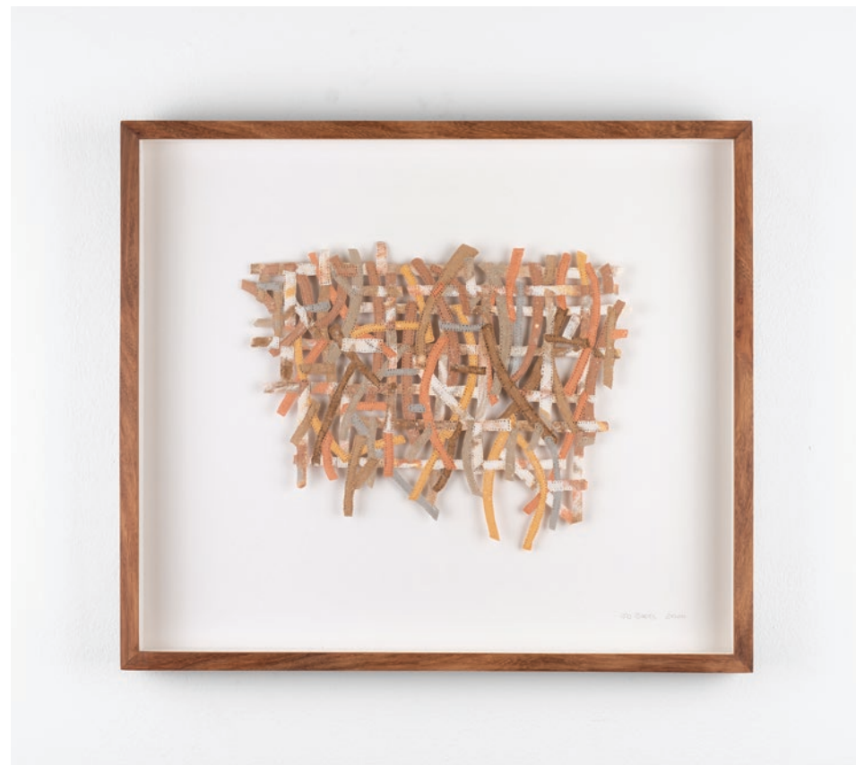
Jo Roets Variação 2020 Air-Drying Clay 35.5 x 41 x 3.5 cm