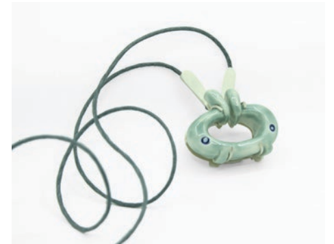
Carine Terreblanche You Can't Heal Under a Mask VI 2020 Porcelain, Silver and Cotton Pendant 4.7 x 4.3 x 1.8 cm