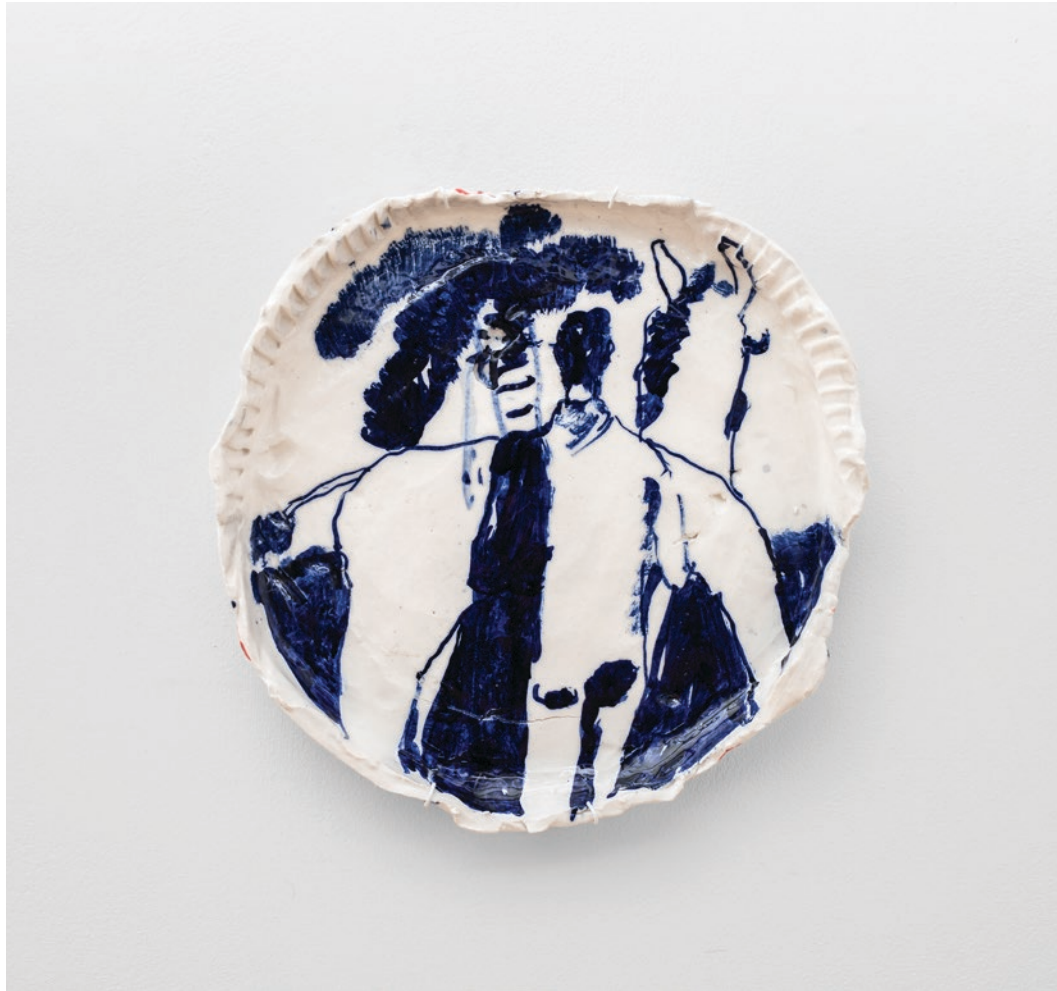
Michael Taylor Pals 2016 Ceramic 35 x 35 x 4 cm

b. 1979, Cape Town, South Africa. Lives and works in Cape Town, South Africa.