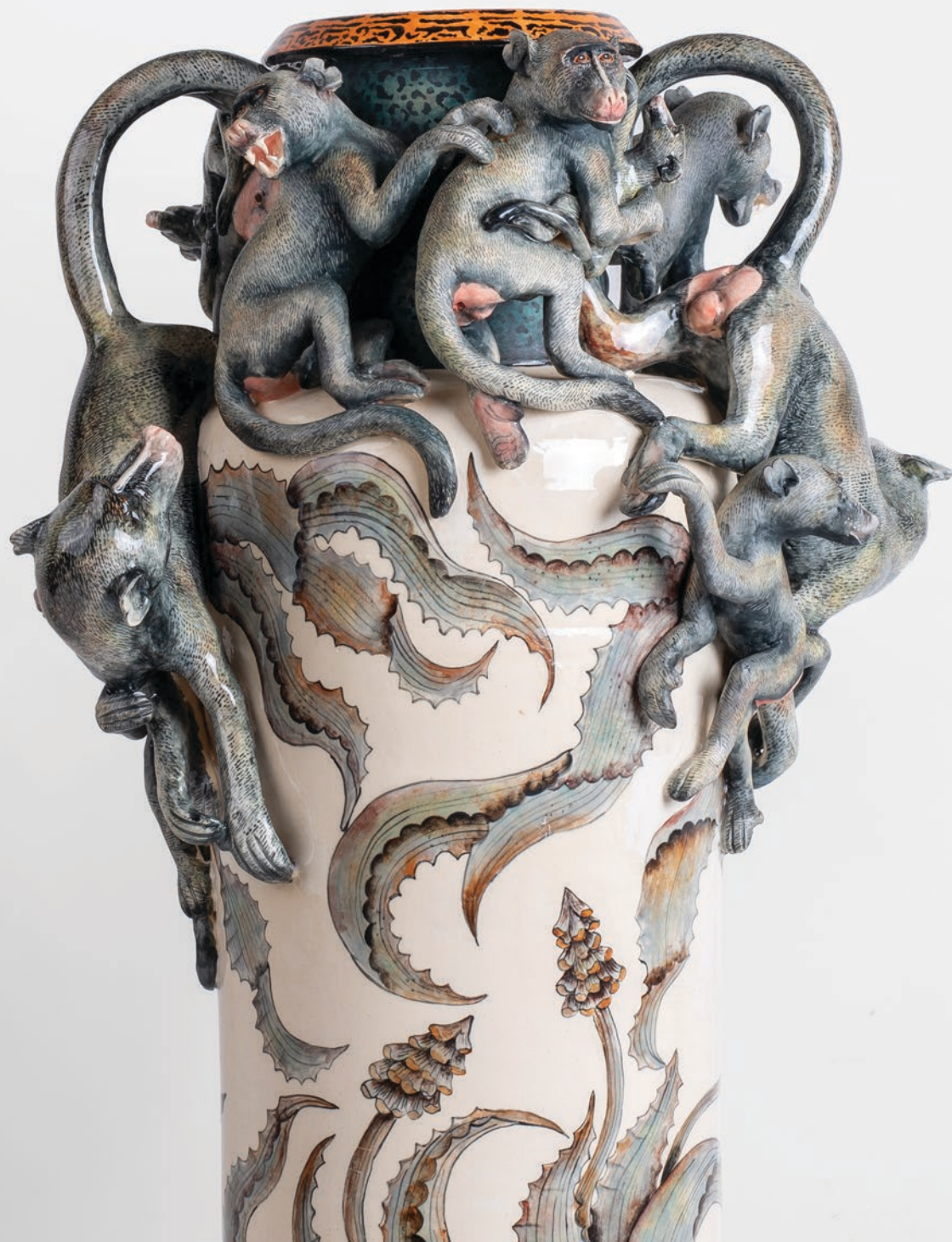
Moshe Sello & Mthulisi Ncube (Ardmore) Baboon & Aloe Vessel (Detail) 2018