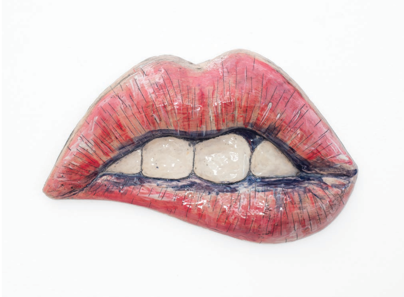
Frances Goodman Biting Lips Red I 2019 Glazed Ceramic 40 x 26 x 4 cm

b. 1975, Johannesburg, South Africa. Lives and works in Johannesburg, South Africa.