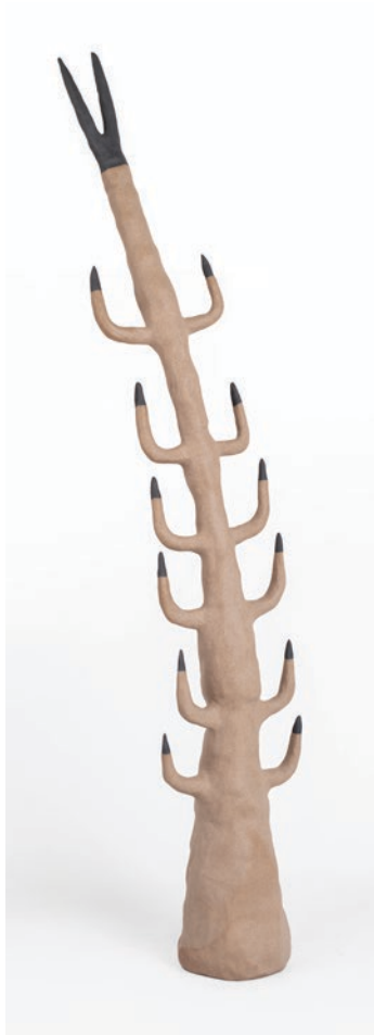
Karlién van Rooyen Centipede Pyre 2020 Buff Stoneware and Manganese 71 x 13 x 13 cm