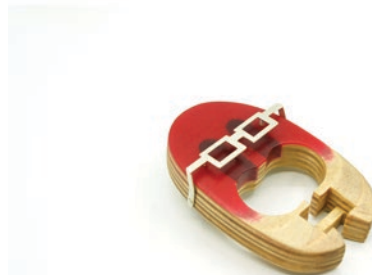
Carine Terreblanche You Can't Heal Under a Mask V 2020 Wood, Resin and Silver Brooch 7 x 4.5 x 2.1 cm