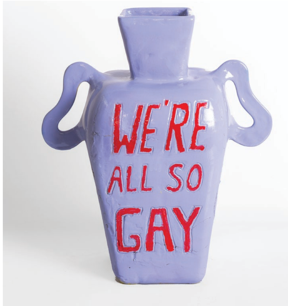
Githan Coopoo We're all so gay 2020 Clay and Acrylic Paint 36 x 29 cm

b. 1994, Cape Town, South Africa. Lives and works in Cape Town, South Africa.