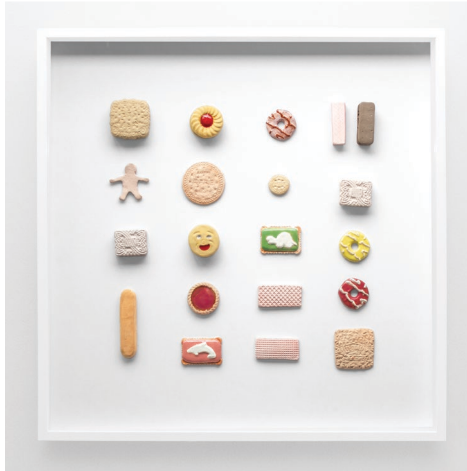
Geena Wilkinson Untitled (Biscuits) IV 2020 Ceramic 58 x 58 cm

b. 1994, Cape Town, South Africa. Lives and works in Cape Town, South Africa.