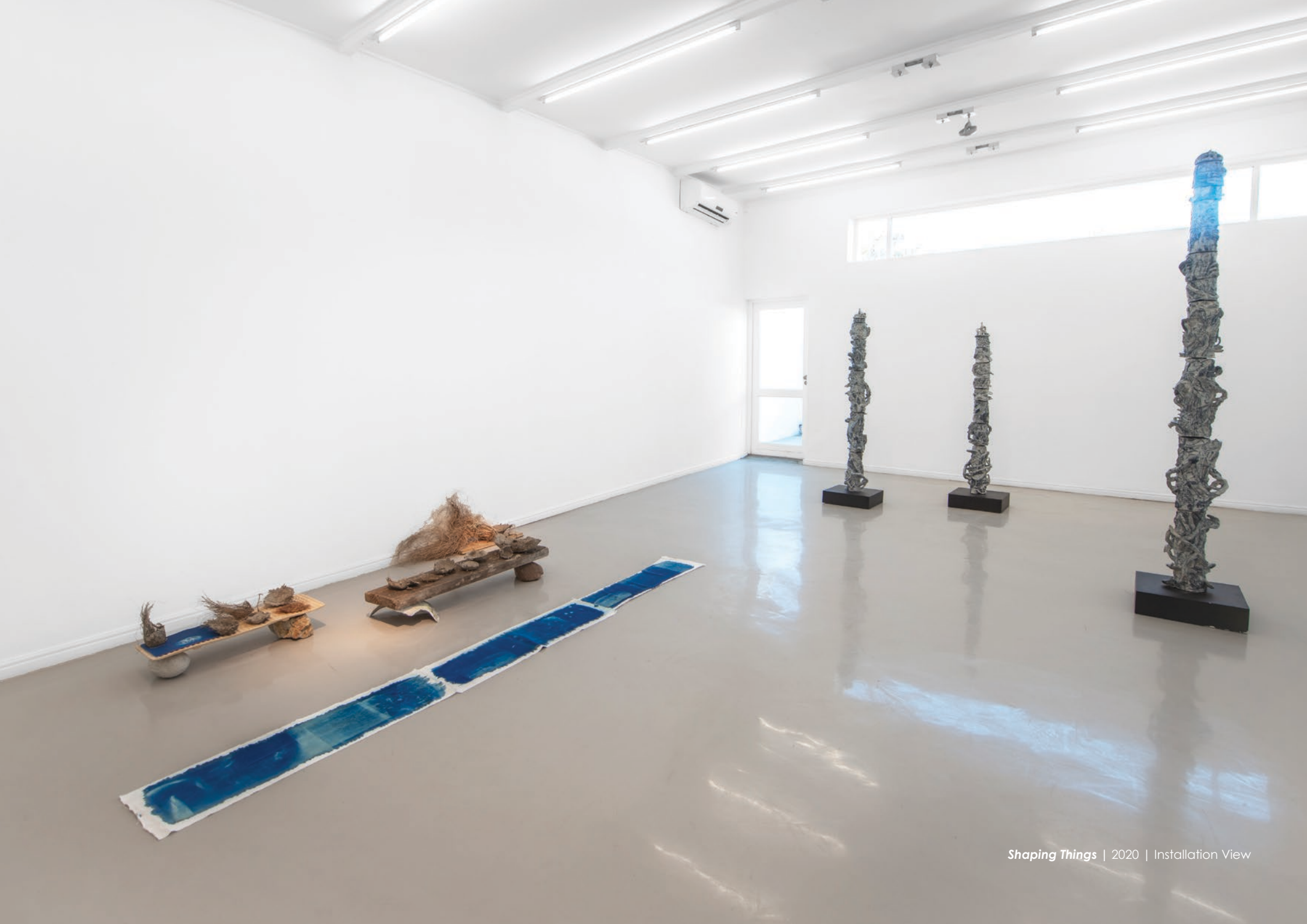
Shaping Things | 2020 | Installation View