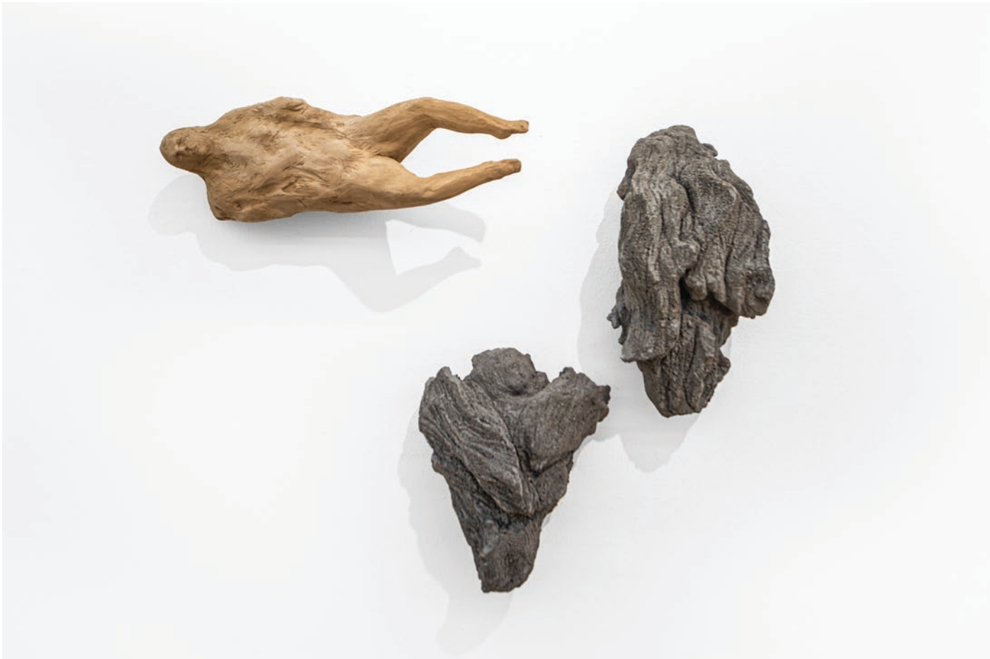
Ledelle Moe Drift 2020 Clay and Concrete Dimensions Variable

b. 1971, Durban, South Africa. Lives and works in Cape Town, South Africa.