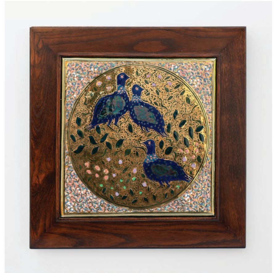
Esias Bosch Untitled III n.d. Hand Painted Ceramic Tile with Luster Glaze 43.5 x 43 cm