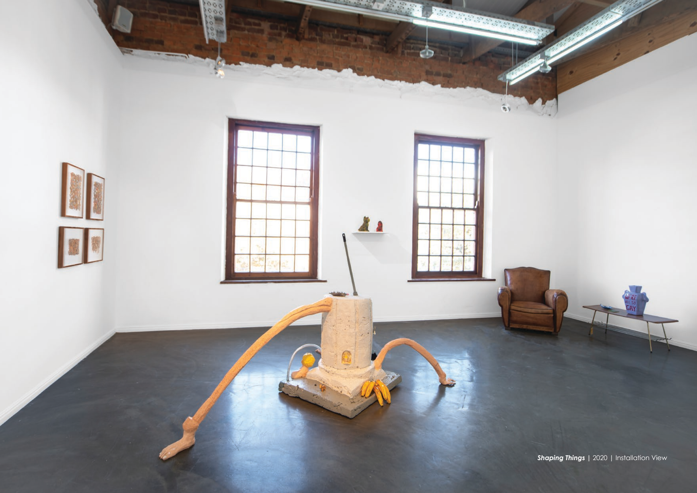
Shaping Things | 2020 | Installation View