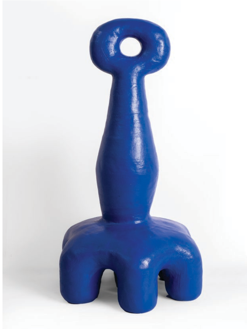
Ben Orkin Don't worry about changing things that can't be changed 2020 Glazed Ceramic 68 x 34 x 34 cm