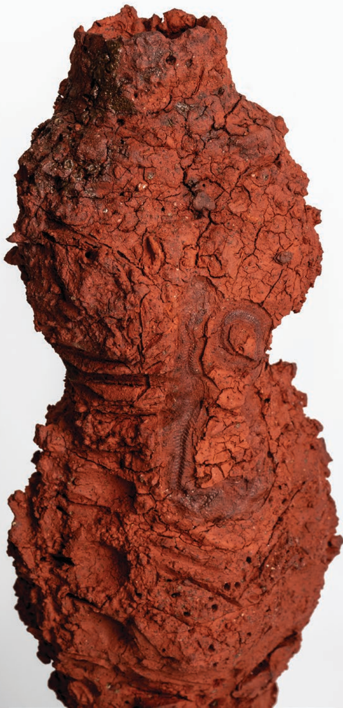
Belinda Blignaut The Call From Things (Detail) 2020