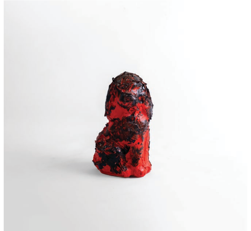
Georgina Gratrix Red Dog 2020 Oil on Ceramic 17 x 10 x 7.5 cm