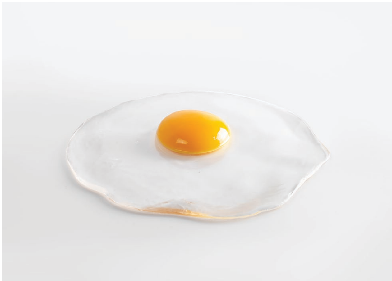
Geena Wilkinson Spill 2019 Resin 29 x 32.5 x 3 cm ED 1/6 + 2AP