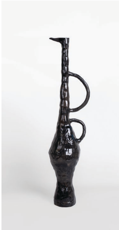
Karlién van Rooyen altAR Mother 2020 Buff Stoneware and Manganese Glaze 62 x 18 x 13.5 cm