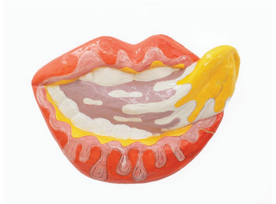
Frances Goodman Icecream Tongue II 2019 Glazed Ceramic 50 x 37 x 8 cm