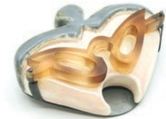
Carine Terreblanche You Can't Heal Under a Mask III 2020 Porcelain, Perspex, Silver and Plastic Brooch 4.2 x 5.2 x 1.8 cm