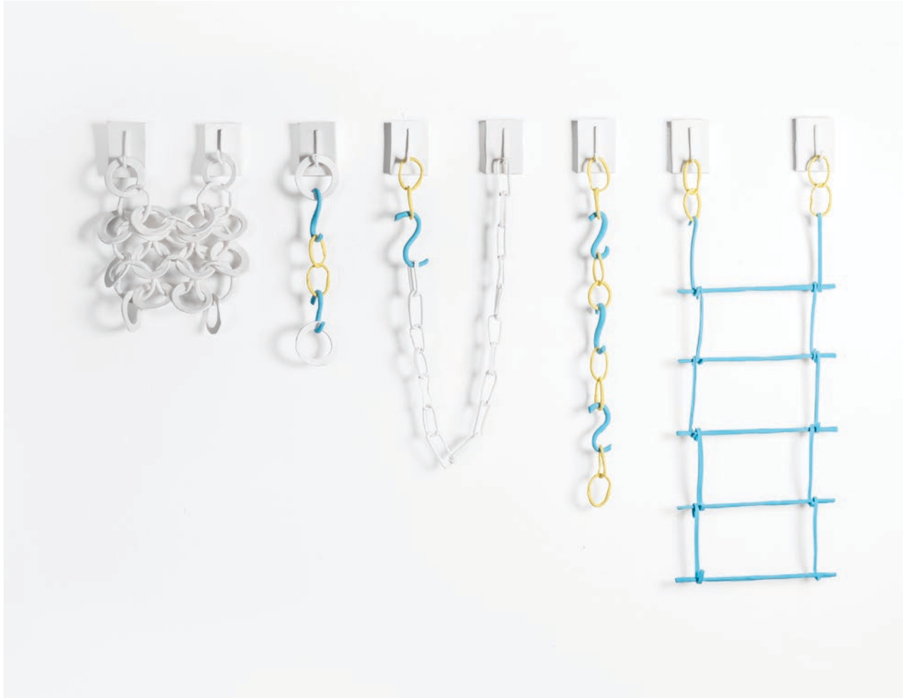
Pierre Le Riche Study for a chain reaction 2020 Porcelain Collage 75 x 120 cm

b. 1986, Port Elizabeth, South Africa. Lives and works in Cape Town, South Africa.