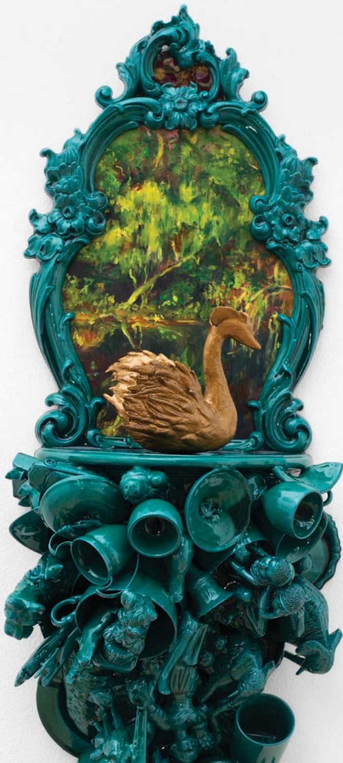
Stephané Conradie Ouma sê jy moet daai swaan brasso (Detail) 2020