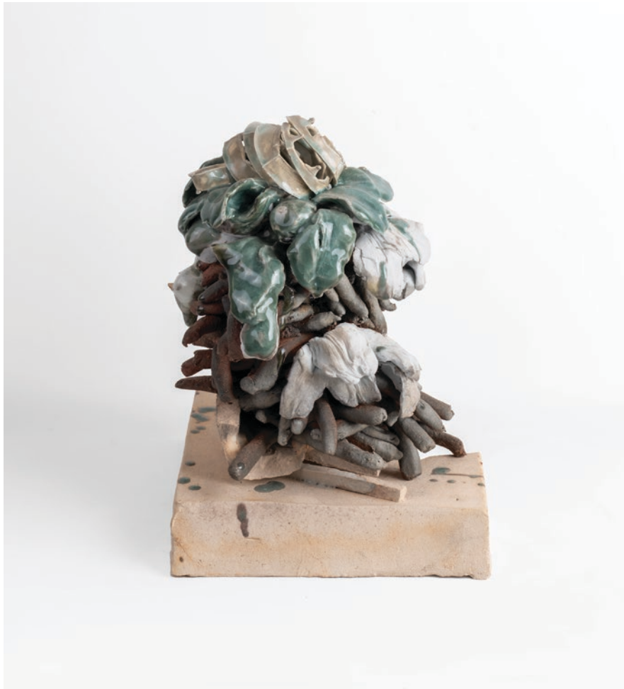
Jeanne Hoffman Shipwrecked cargoes 1 2020 Stoneware and Porcelain 30 x 23 x 24 cm