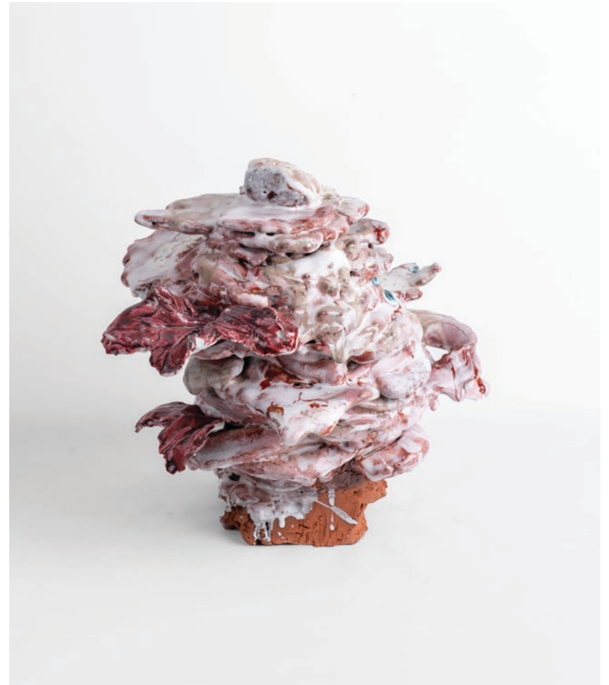
Jeanne Hoffman Calypso 2020 Terra-cotta and Porcelain 27 x 28 x 23 cm