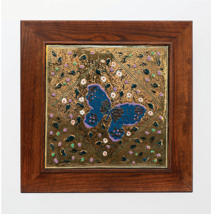
Esias Bosch Untitled II n.d. Hand Painted Ceramic Tile with Luster Glaze 43 x 43.5 cm