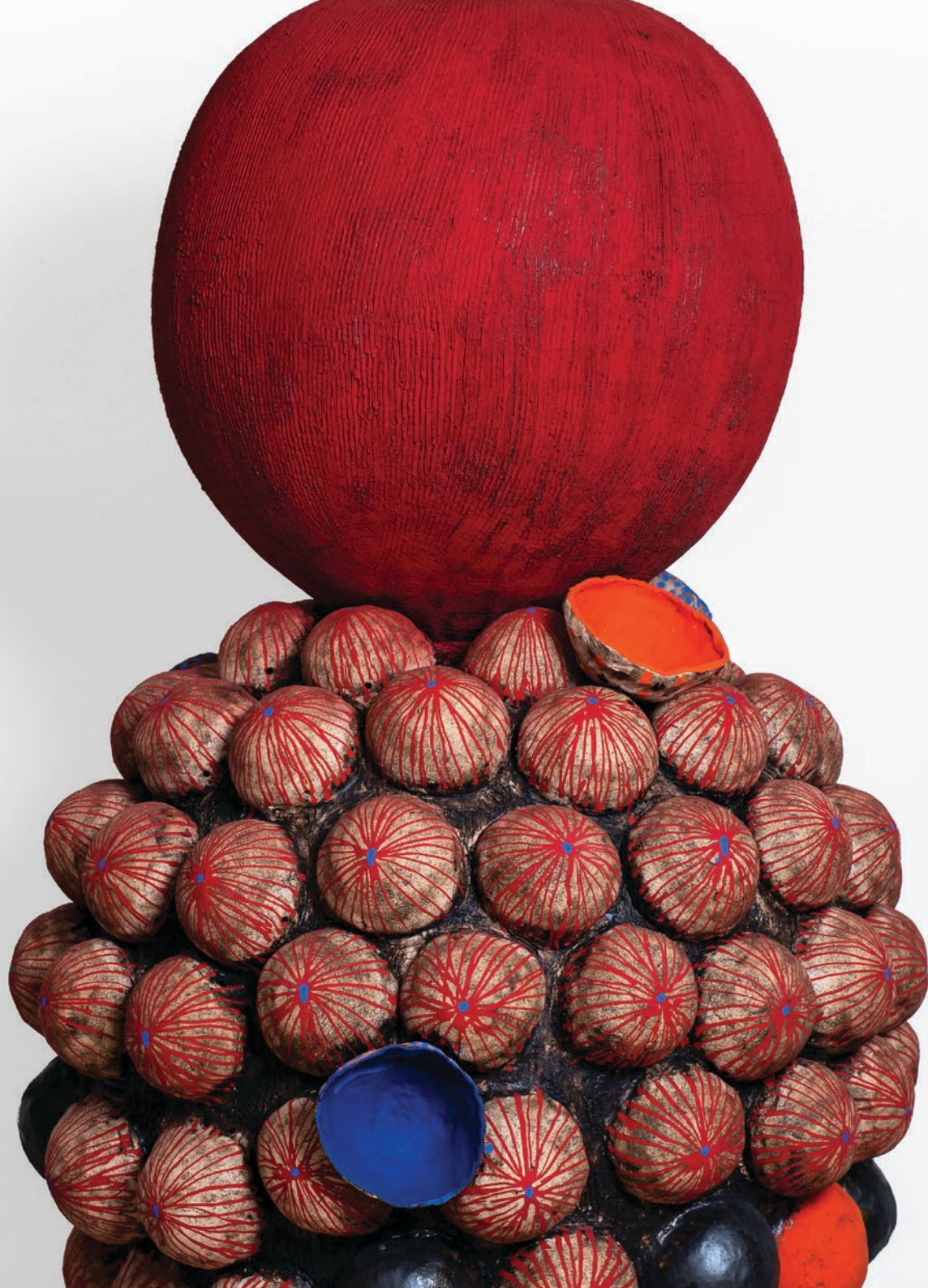
Zizipo Poswa Nozibhedlele (Detail) 2020