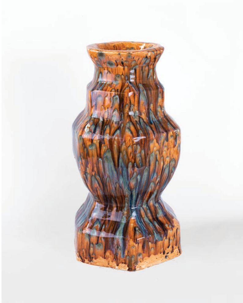
Eva Shuman Jannes' comeback 2020 Glazed Earthenware 45 x 26 x 21 cm