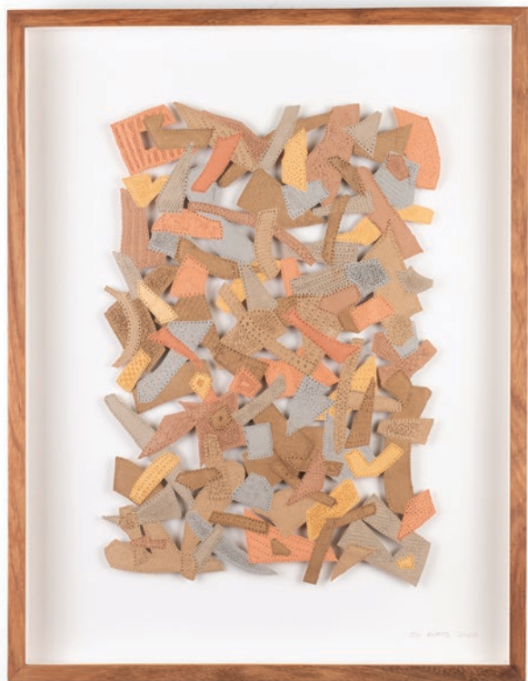
Jo Roets Transição #1 2020 Air-Drying Clay 46.5 x 35 x 3.5 cm