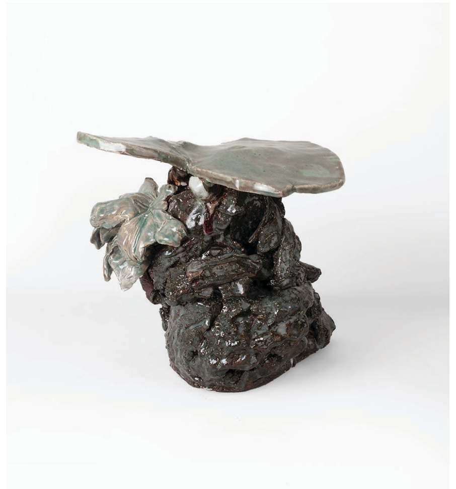
Jeanne Hoffman Shipwrecked cargoes 2 2020 Stoneware & Porcelain 27 x 27 x 22 cm