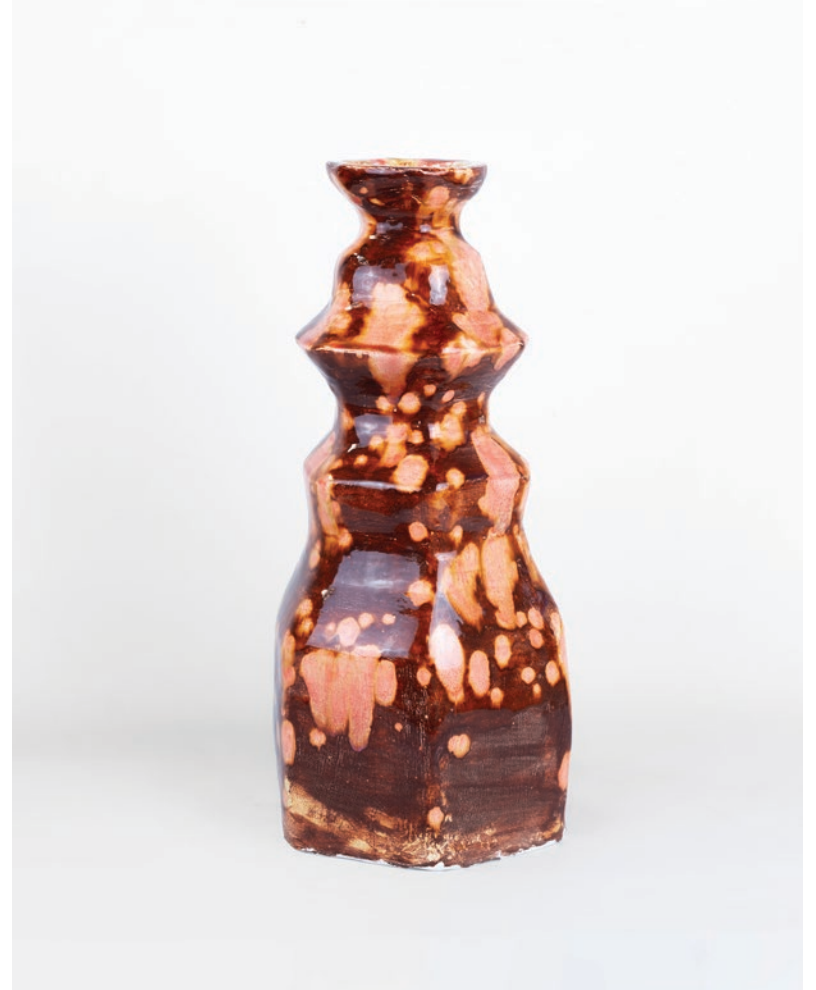
Eva Shuman My small, small house 2020 Glazed Earthenware 42 x 21 x 17 cm