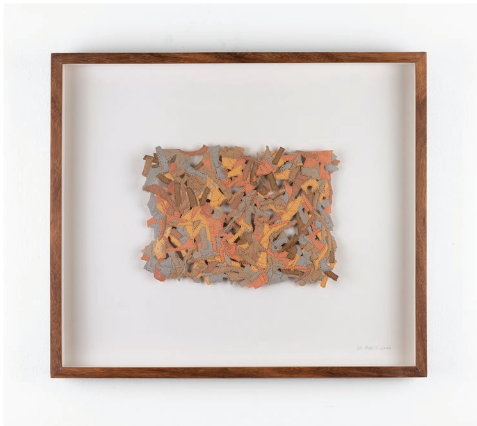
Jo Roets Acolchoado 2020 Air-Drying Clay 35.5 x 41 x 3.5 cm

b. 1979, Cape Town, South Africa. Lives and works in Cape Town, South Africa.