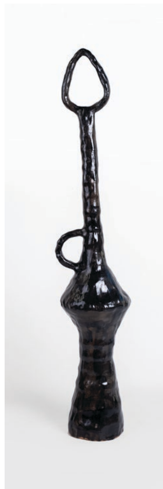
Karlién van Rooyen alTAR With Child 2020 Buff Stoneware and Manganese Glaze 64 x 13 x 13 cm