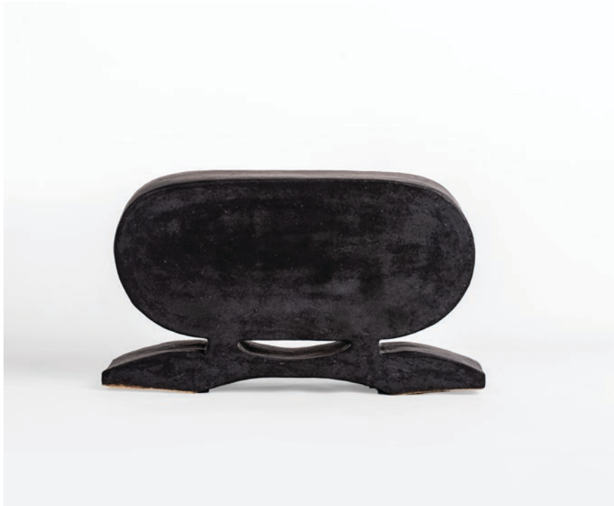
Carine Terreblanche Memory Loves Time 2020 Stoneware Clay 14.5 x 23 x 5.2 cm

b. Cape Town, South Africa. Lives and works in Cape Town, South Africa.