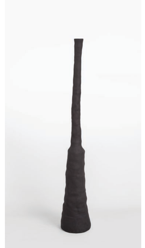
Karlien van Rooyen Petrol Whistle 2020 Nude Manganese Stoneware 64.5 x 10 x 10 cm