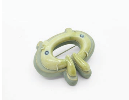
Carine Terreblanche You Can't Heal Under a Mask II 2020 Porcelain, Wood, Plastic and Silver Brooch 4.3 x 5.3 x 2 cm