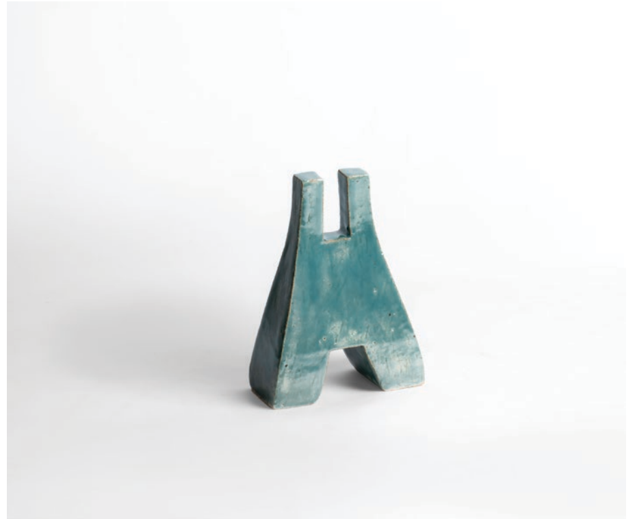
Carine Terreblanche One Monumental Moment in Time 2020 Stoneware Clay 15 x 10.8 x 5 cm