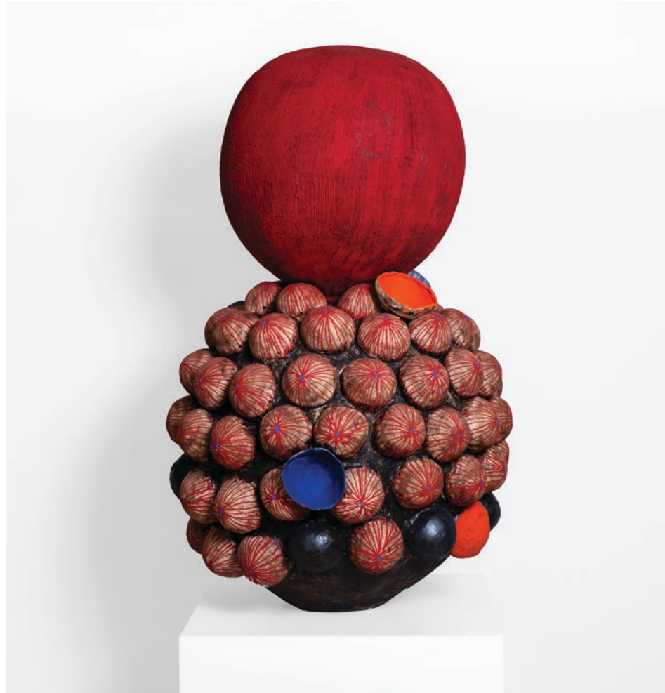
Zizipho Poswa Nozibhedlele 2020 Glazed Stoneware Clay 117 x 80 x 80 cm

b. 1979, Umtata, South Africa. Lives and works in Cape Town, South Africa.