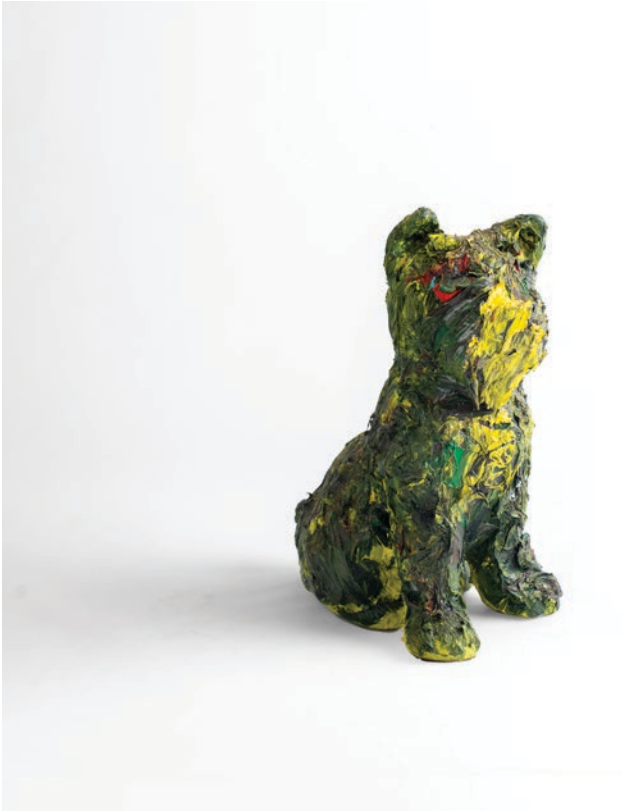
Georgina Gratrix Yellow Dog 2020 Oil on Ceramic 23 x 11.5 x 16 cm

b. 1982, Mexico City, Mexico. Lives and works in Cape Town, South Africa.