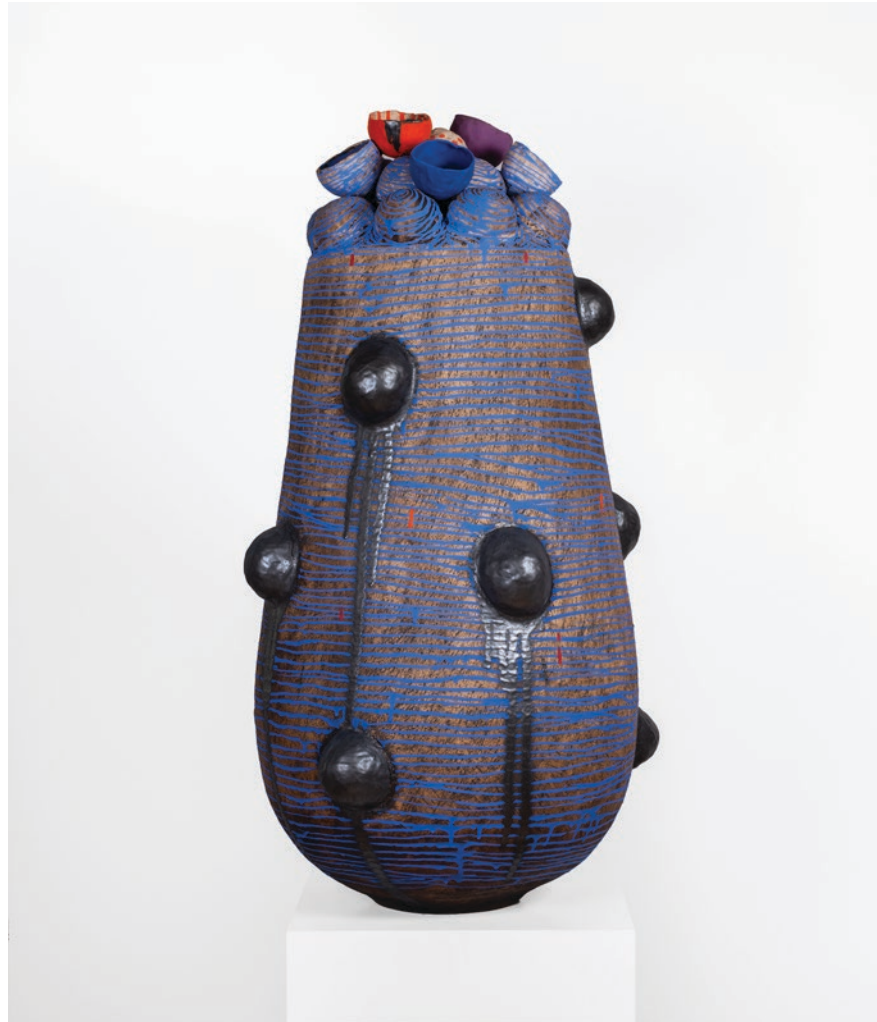
Zizipho Poswa Noxolo 2020 Glazed Stoneware Clay 116 x 80 x 80 cm