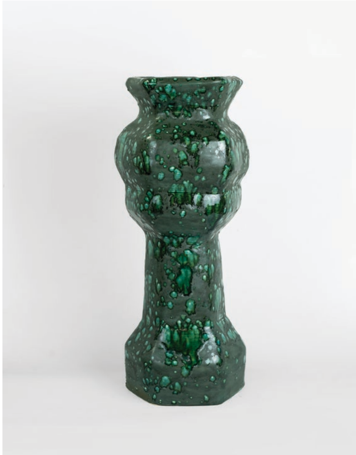
Eva Shuman Boomslang Glam 2020 Glazed Earthenware 49 x 22 x 22 cm

b. 1989, Cape Town, South Africa. Lives and works in Cape Town, South Africa.