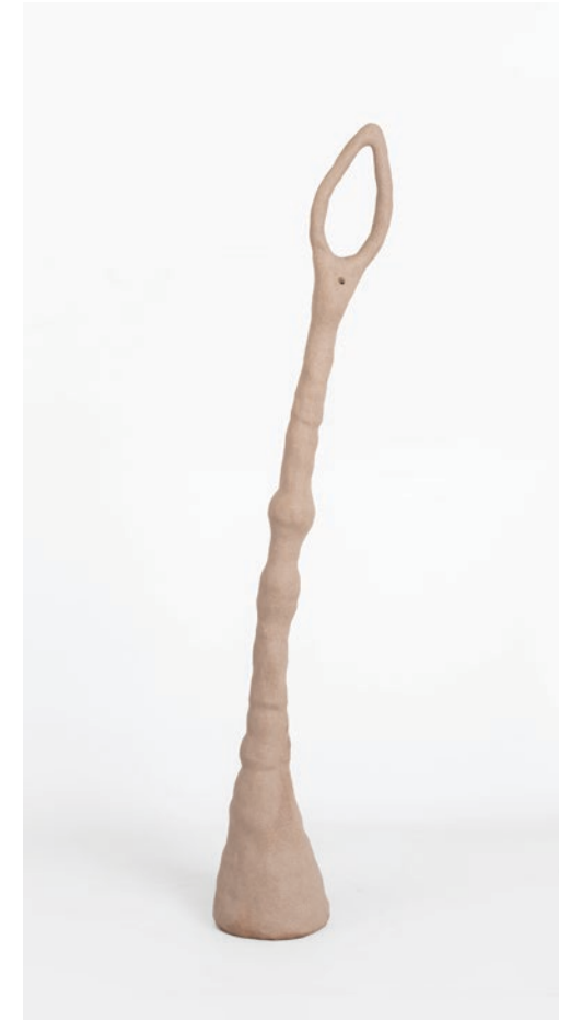
Karlién van Rooyen Cobra Pyre 2020 Buff Stoneware 63 x 16 x 11 cm