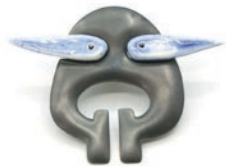
Carine Terreblanche You Can't Heal Under a Mask IV 2020 Silver and Porcelain Brooch 5.6 x 7.7 x 1 cm