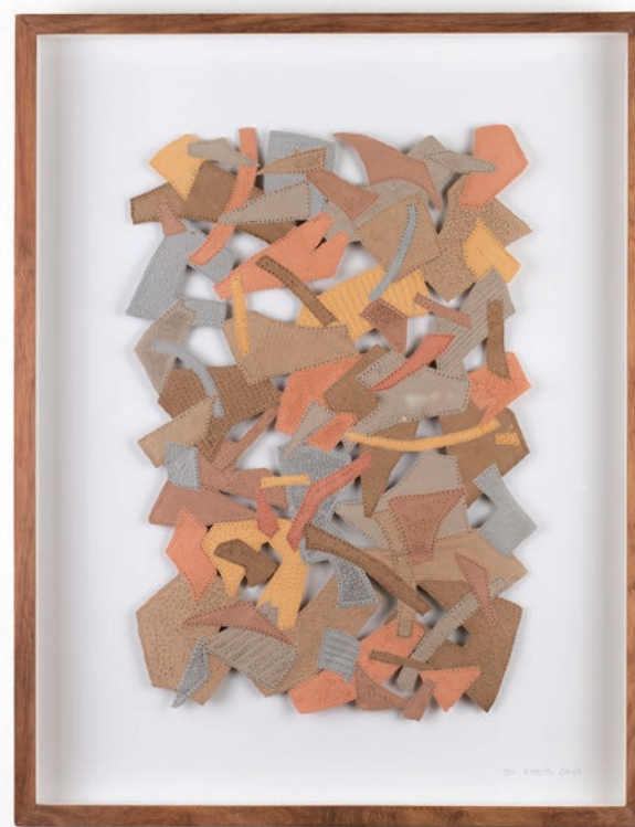
Jo Roets Transição #2 2020 Air-Drying Clay 46.5 x 35 x 3.5 cm