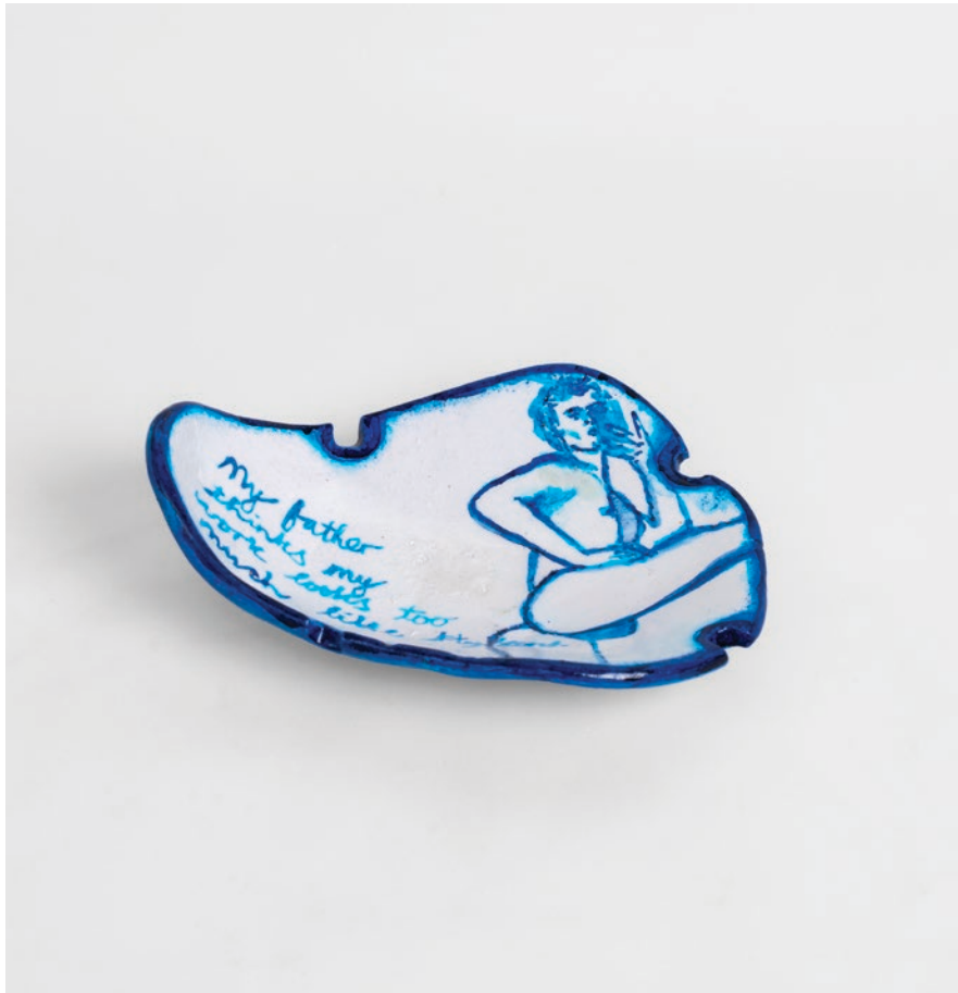
Githan Coopoo Jockstrap Ashtray (my father thinks my work looks too much like Hyltons) 2020 Clay and Acrylic Paint 14 x 11 x 5 cm