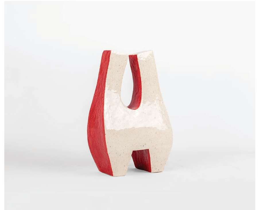
Carine Terreblanche A Monument to Memory 2020 Stoneware Clay 22.3 x 14.3 x 8 cm