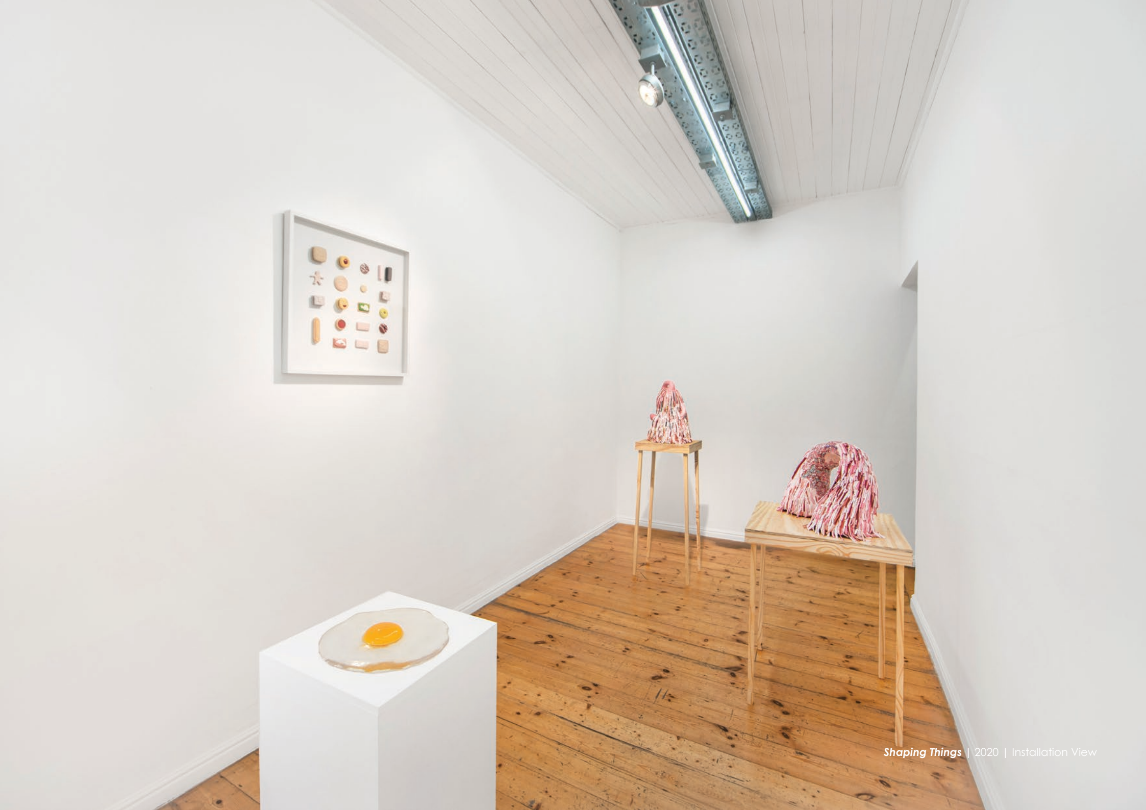
Shaping Things | 2020 | Installation View