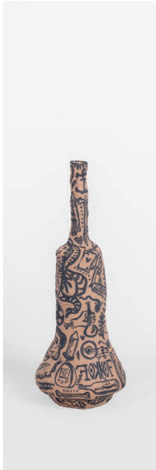
Karlién van Rooyen Chappie Um 2020 Buff Stoneware and Manganese 25 x 18 x 18 cm