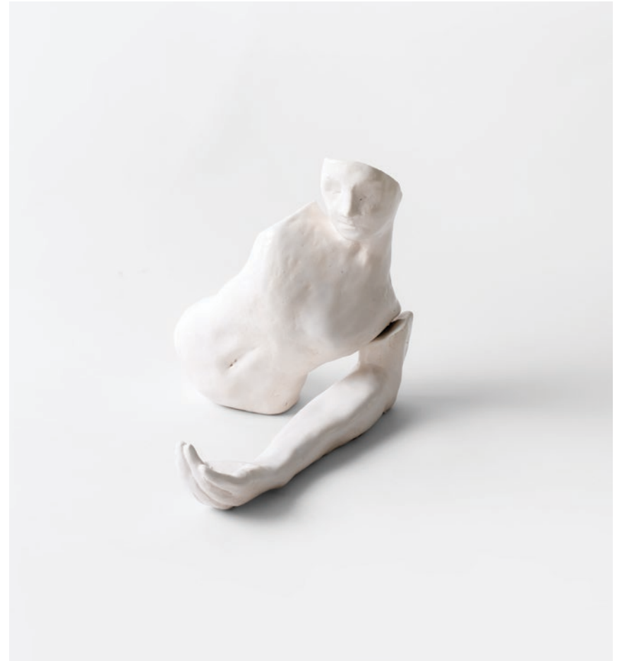
Colijn Strydom A history of a breath 2020 Glazed Ceramic Stoneware Dimensions Variable