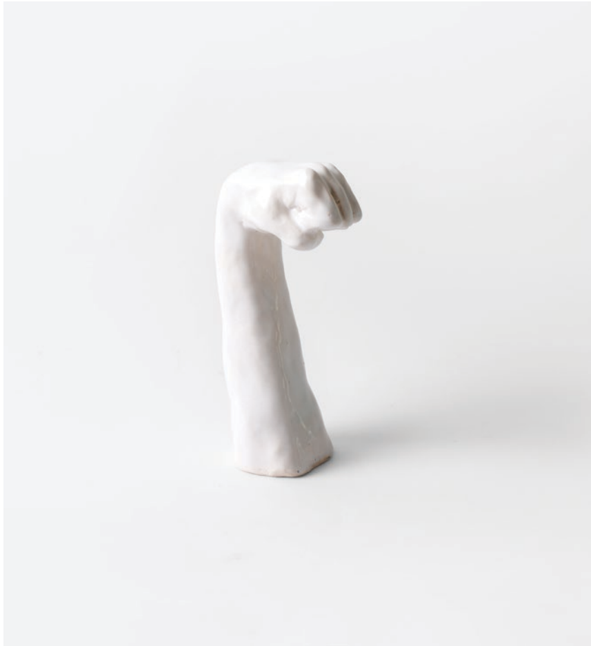
Colijn Strydom A history of a breath 2020 Glazed Ceramic Stoneware 6 x 13 x 6 cm