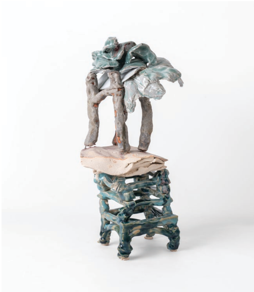
Jeanne Hoffman Shipwrecked cargoes 3 2020 Stoneware and Porcelain 35 x 15 x 12 cm