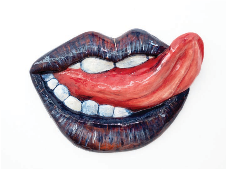
Frances Goodman Red Tongue 2019 Glazed Ceramic 50 x 37 x 8 cm