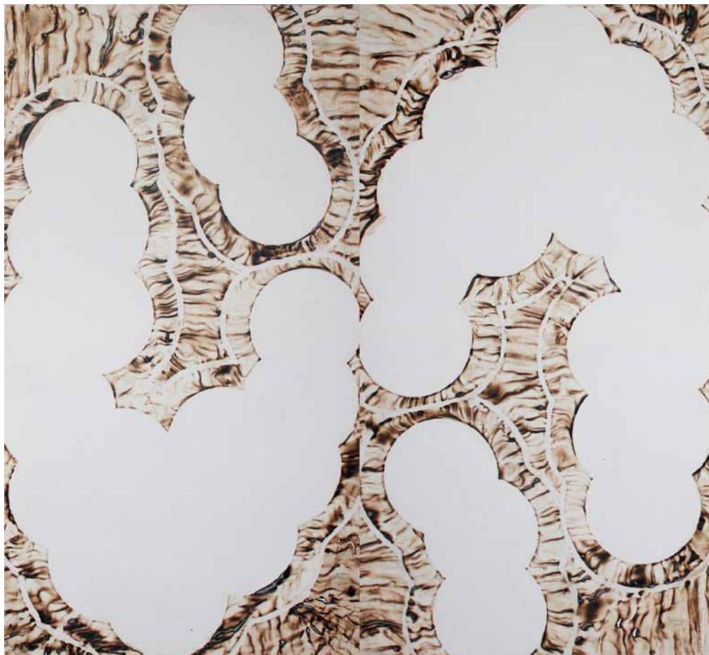
Artoms Archetype Forms Case 12 2012 Fire, Water, Air and Earth on Canvas 160 x 145 cm