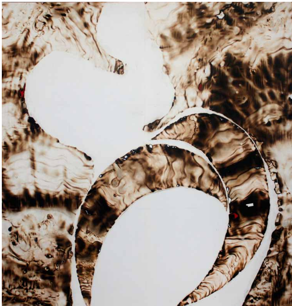
Artoms Archetype Forms Case 14 2012 Fire, Water, Air and Earth on Canvas 148 x 143 cm