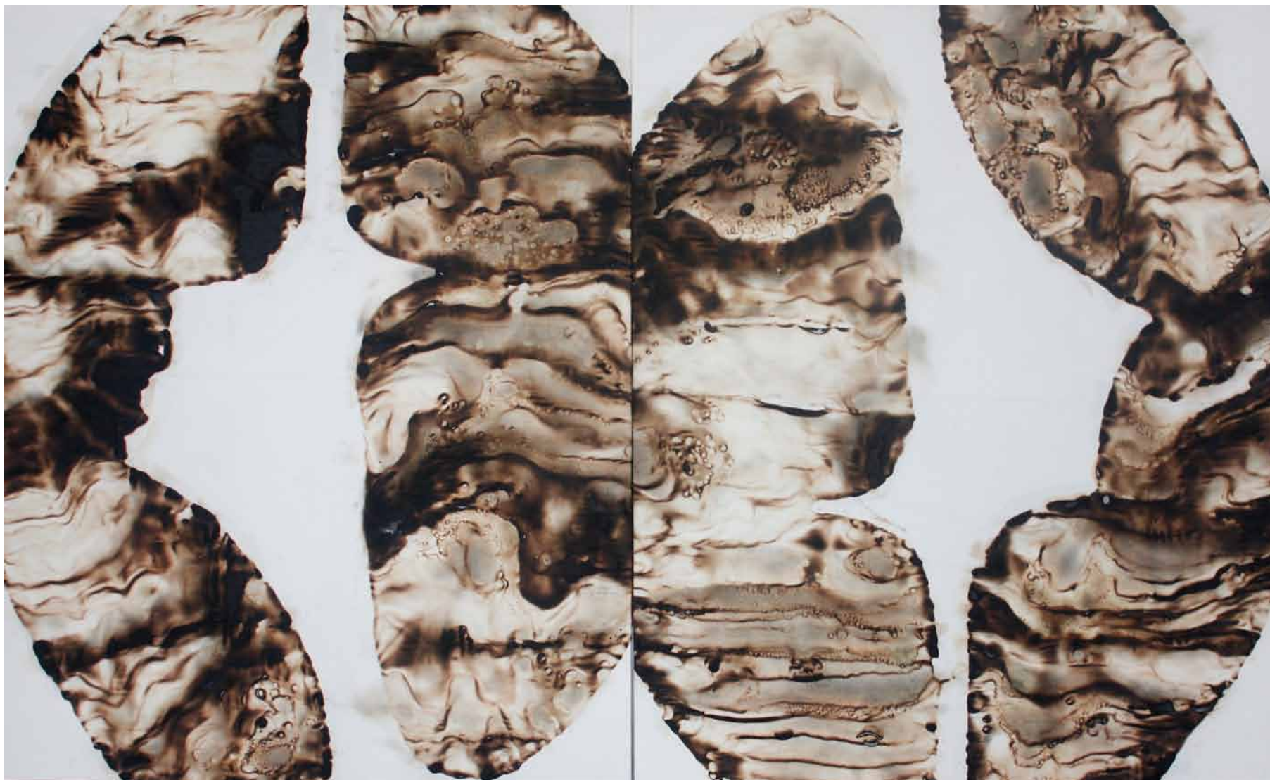
Artoms Archetype Forms Case 1 | 2012 | Fire, Water, Air and Earth on Canvas | 135 x 220 cm