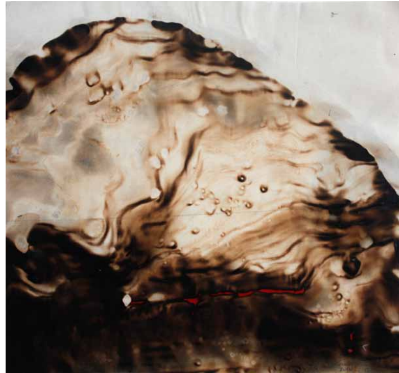
Shard of Archetype Form 5 2012 Fire, Water, Air and Earth on Canvas 58 x 60 cm