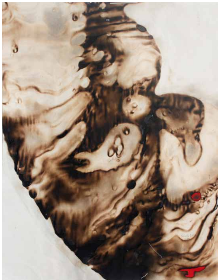
Shard of Archetype Form 1 (Tumbling Water Animals) 2012 Fire, Water, Air and Earth on Canvas 75 x 71 cm