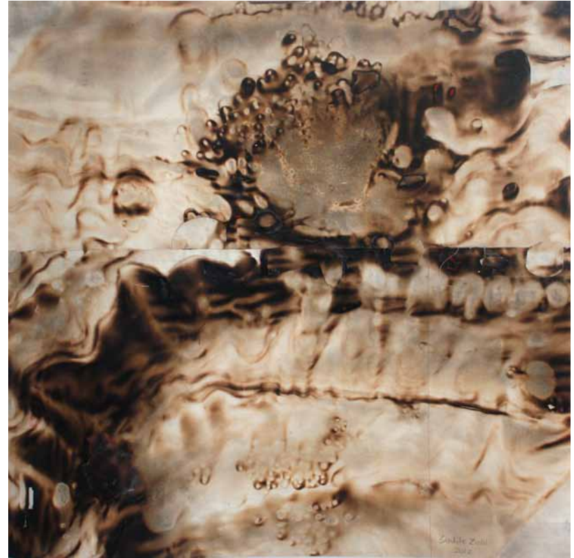
Shard of Archetype Form 2 (Coral Reef) 2012 Fire, Water, Air and Earth on Canvas 68 x 70 cm