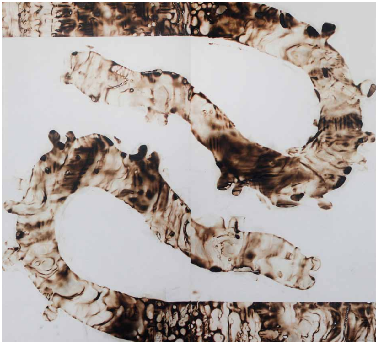
Artoms Archetype Forms Case 8 2012 Fire, Water, Air and Earth on Canvas 160 x 145 cm