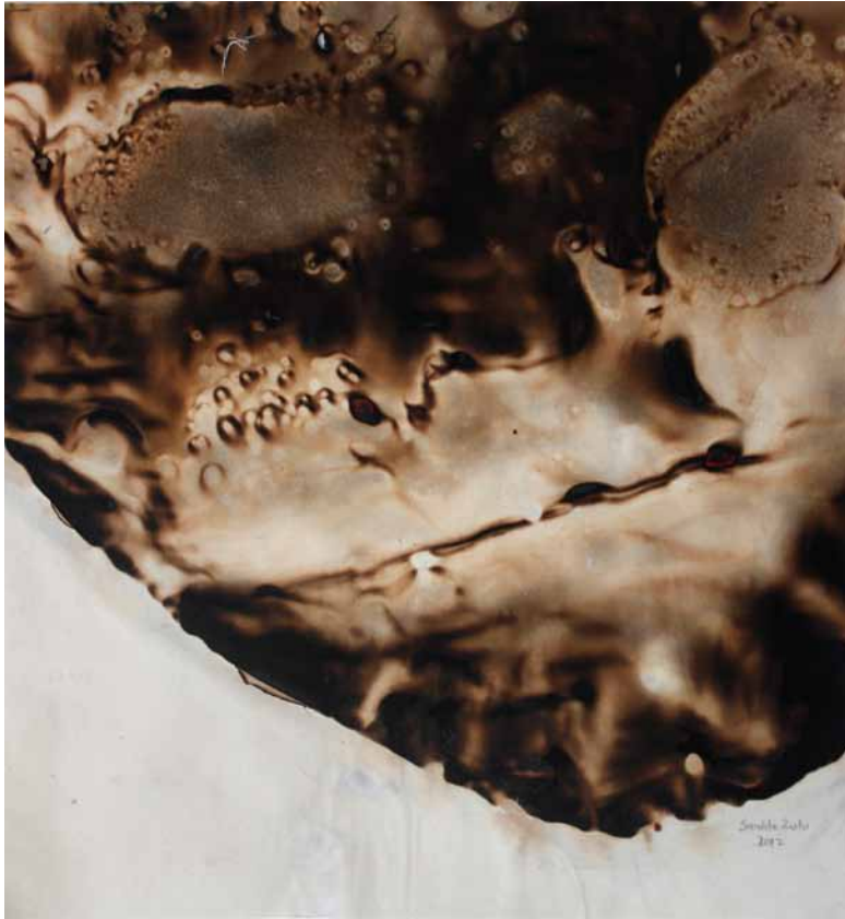
Shard of Archetype Form 6 2012 Fire, Water, Air and Earth on Canvas 60 x 55cm