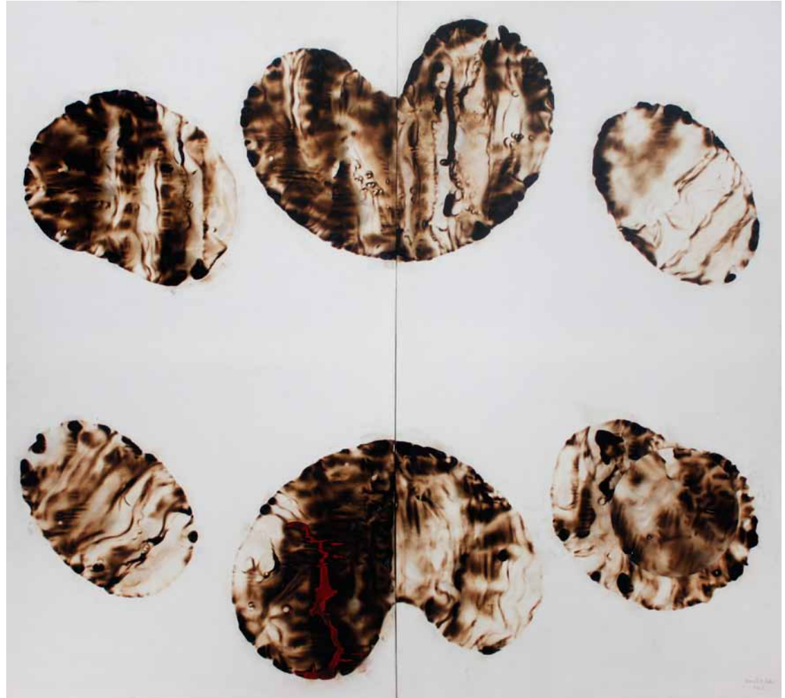
Artoms Archetype Forms no 10 2012 Fire, Water, Air and Earth on Canvas 160 x 145 cm