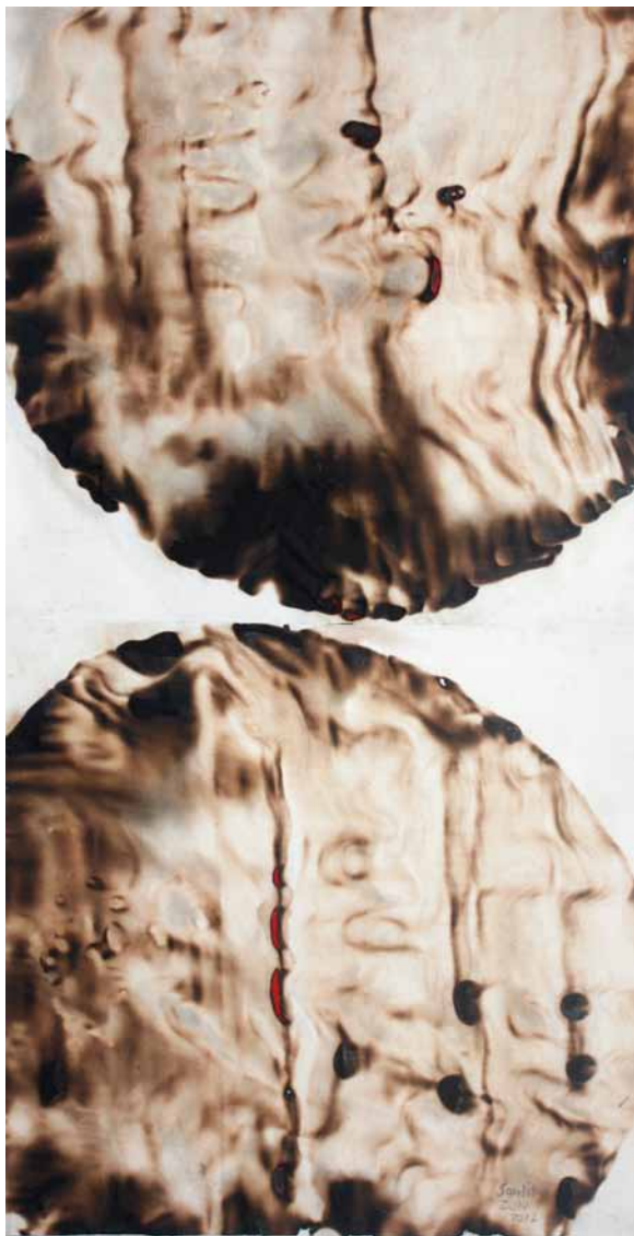
Shard of Archetype Form 4 2012 Fire, Water, Air and Earth on Canvas 90 x 46 cm