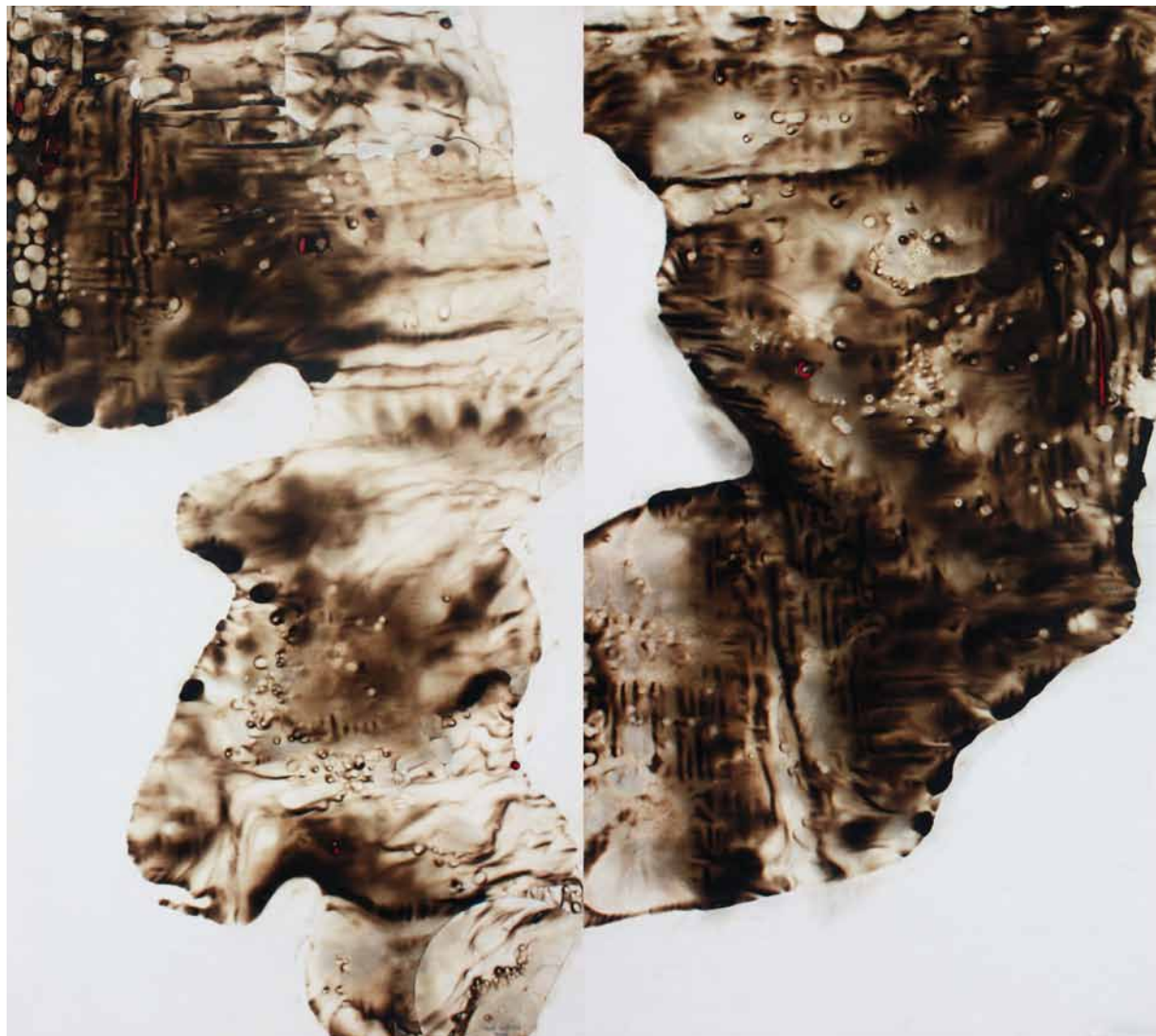
Artoms Archetype Forms Case 6 2012 Fire, Water, Air and Earth on Canvas 160 x 145 cm