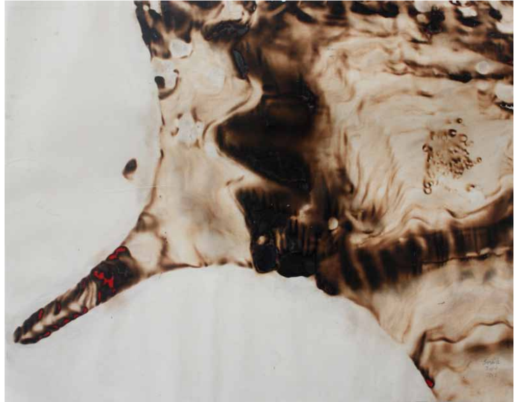
Shard of Archetype Form 3 2012 Fire, Water, Air and Earth on Canvas 60 x 74 cm