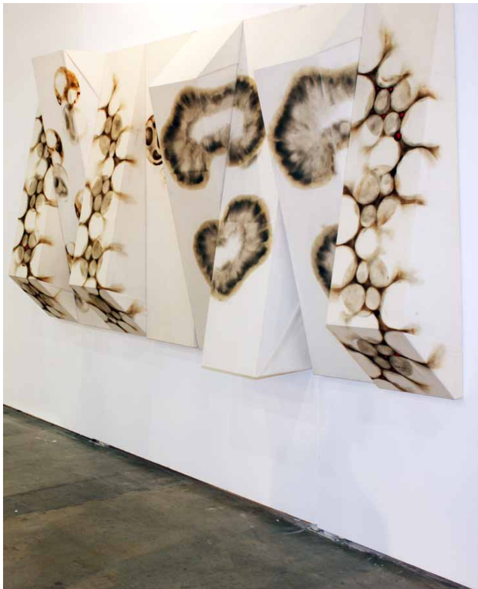
Spinal Diagnoses Fire, Water, Air and Earth on Canvas 145 x 287.5 x 32 cm