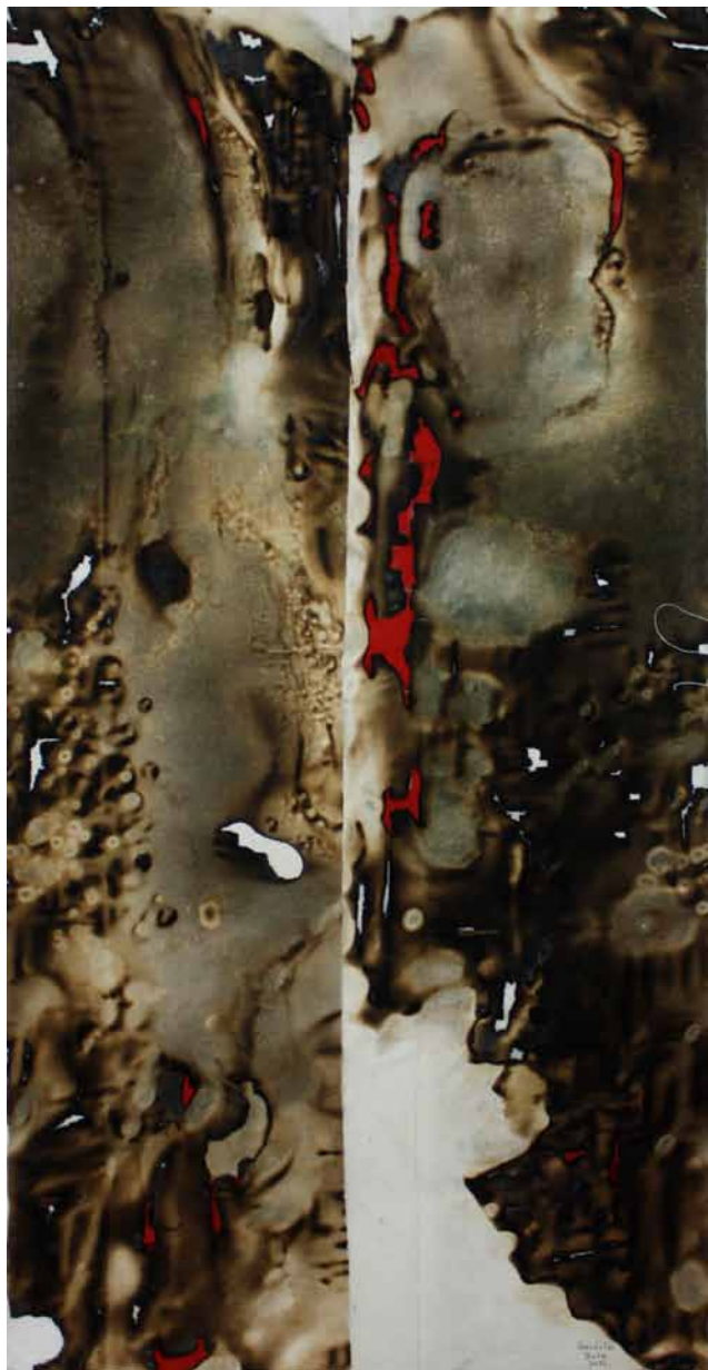
Fossil 2012 Fire, Water, Air, Earth and Canvas 92 x 46 cm