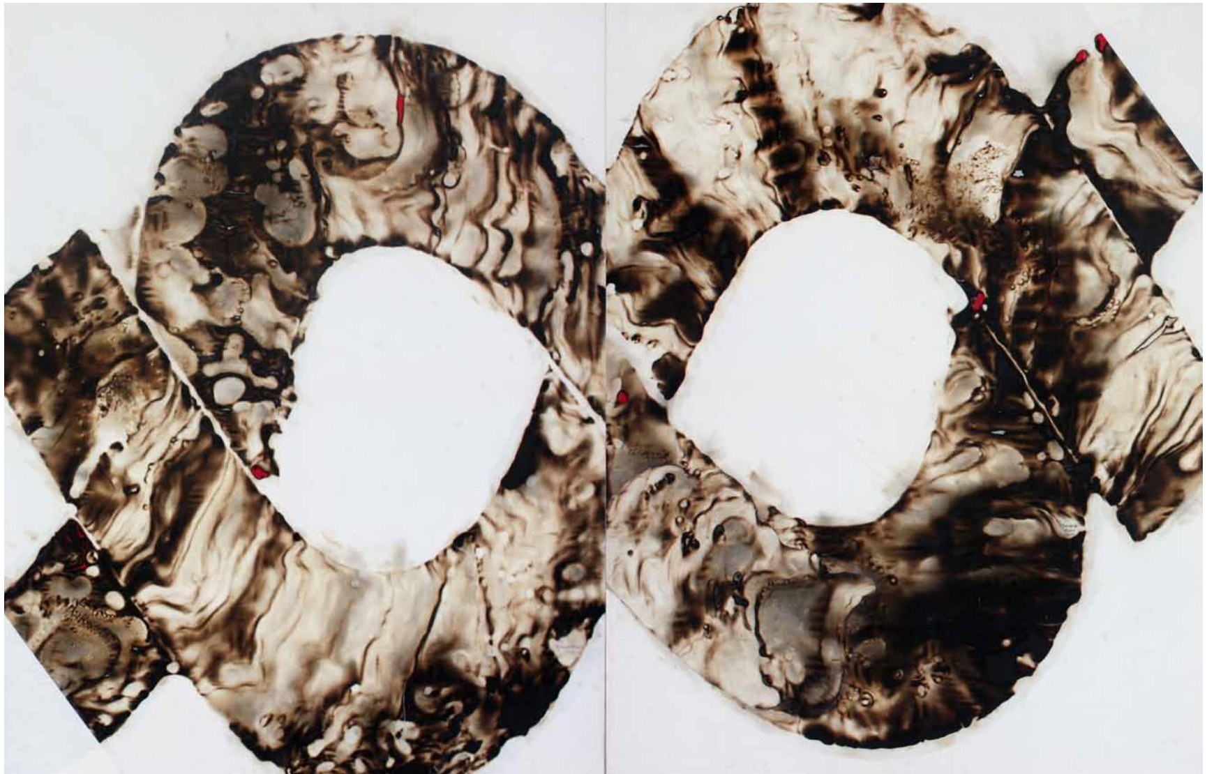
Artoms Archetype Forms Case 2 | 2012 | Fire, Water, Air and Earth on Canvas | 135 x 220 cm