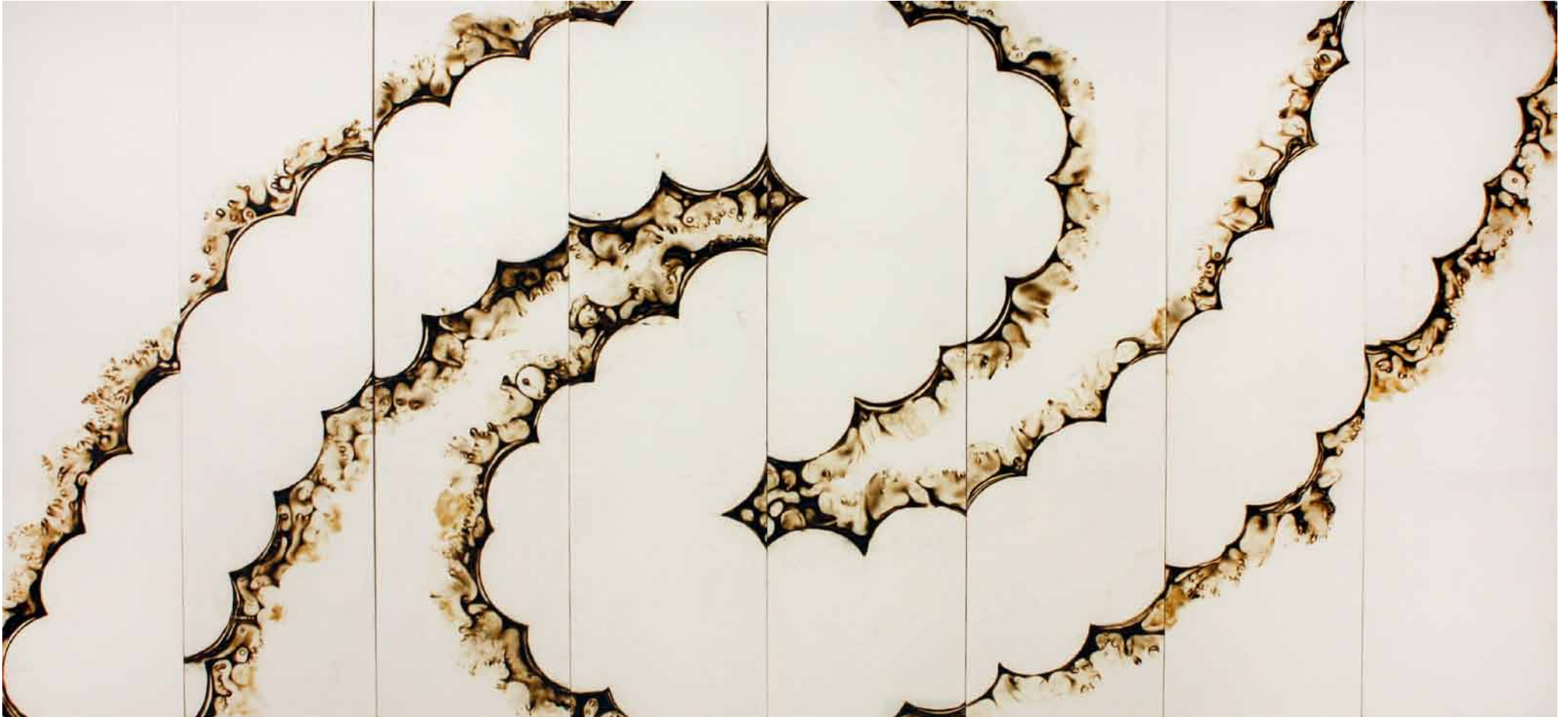
Large Colon(y) Brownprint - a Histopathological Case 2010 Fire, Water, Air and Earth on Canvas 145.5 x 322 cm

Exhibited: National Museum of African Art, Smithsonian Institution, 2011