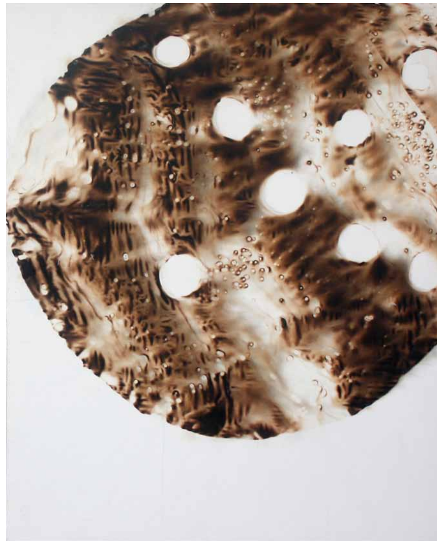
Artoms Archetype Forms Case 5 | 2012 | Fire, Water, Air and Earth on Canvas | 135 x 220 cm