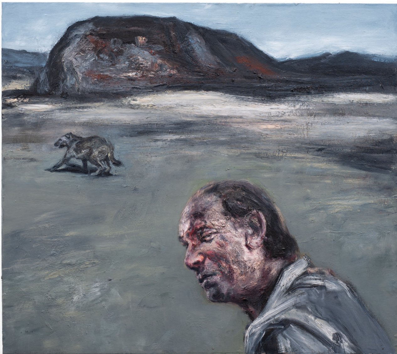
Johann Louw Russiese storie in die Groot Karoo, met hond 2020 Oil on Canvas 122 x 137 cm