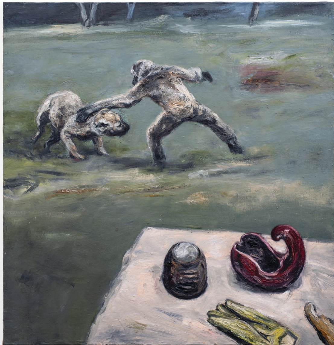
Johann Louw Kastenades, met stillewe 2020 Oil on Canvas 125 x 122 cm