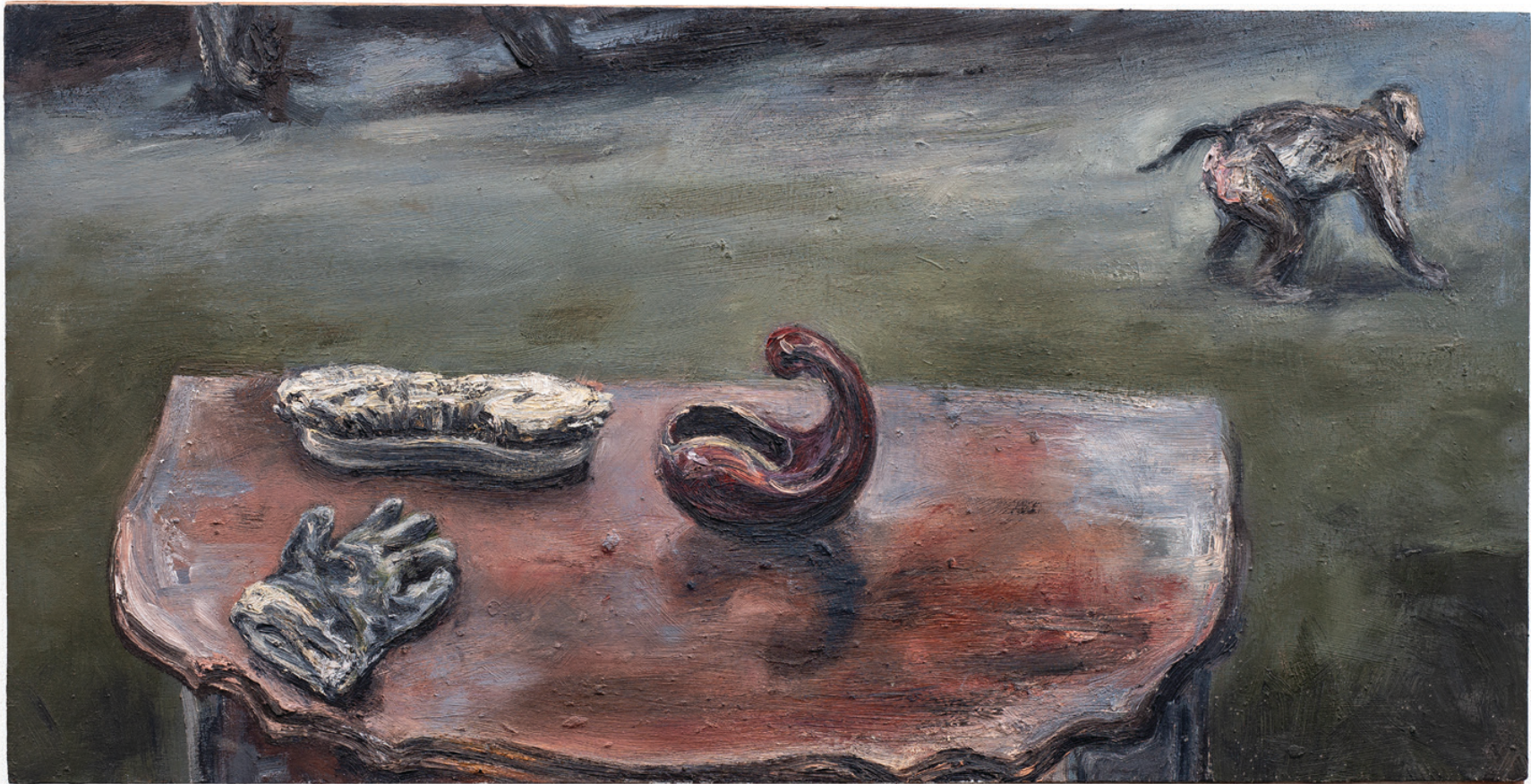
Johann Louw Barok - stillewe, met aap 2020 Oil on Canvas 61 x 120 cm