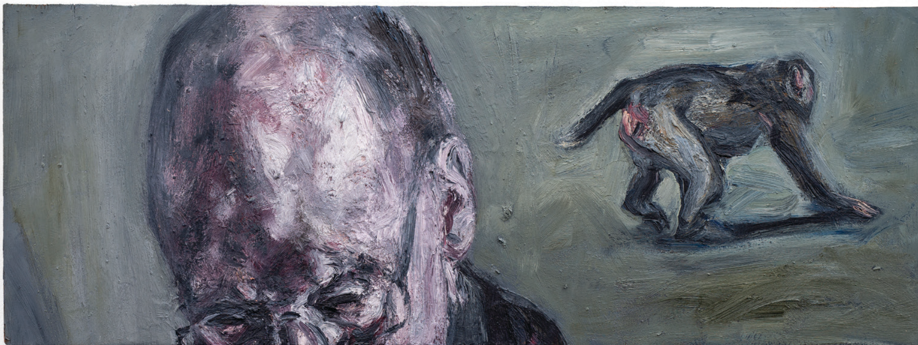
Johann Louw Gebrilde man, en aap 2020 Oil on Canvas 46 x 122 cm