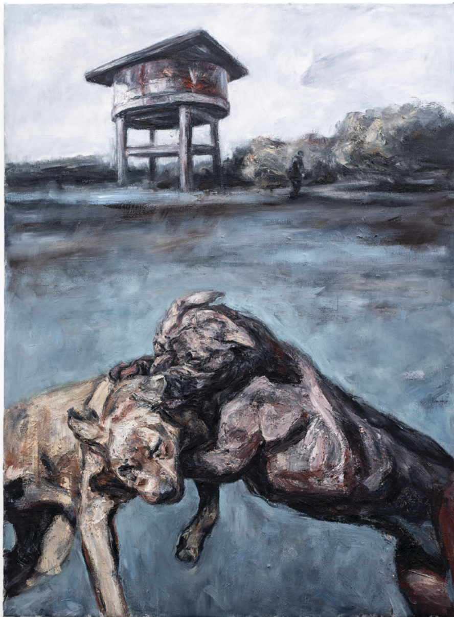
Johann Louw Woeste gevegte 2020 Oil on Canvas 209 x 143 cm