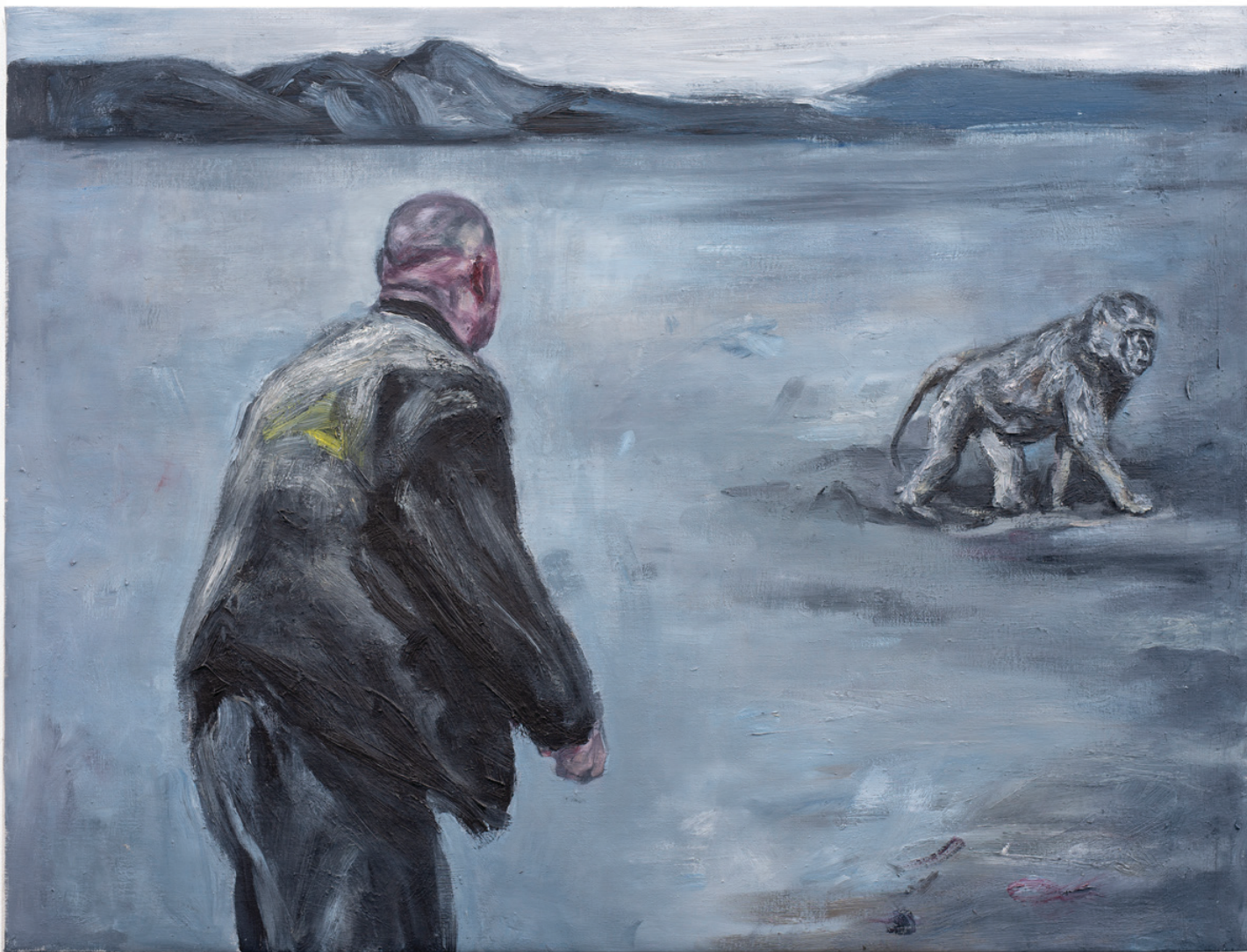
Johann Louw Te voet; skemer 2020 Oil on Canvas 102 x 135 cm