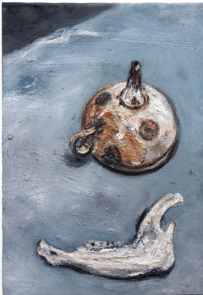
Johann Louw Klein stillewe, met 2 objekte 2020 Oil on Canvas 62.5 x 42.5 cm