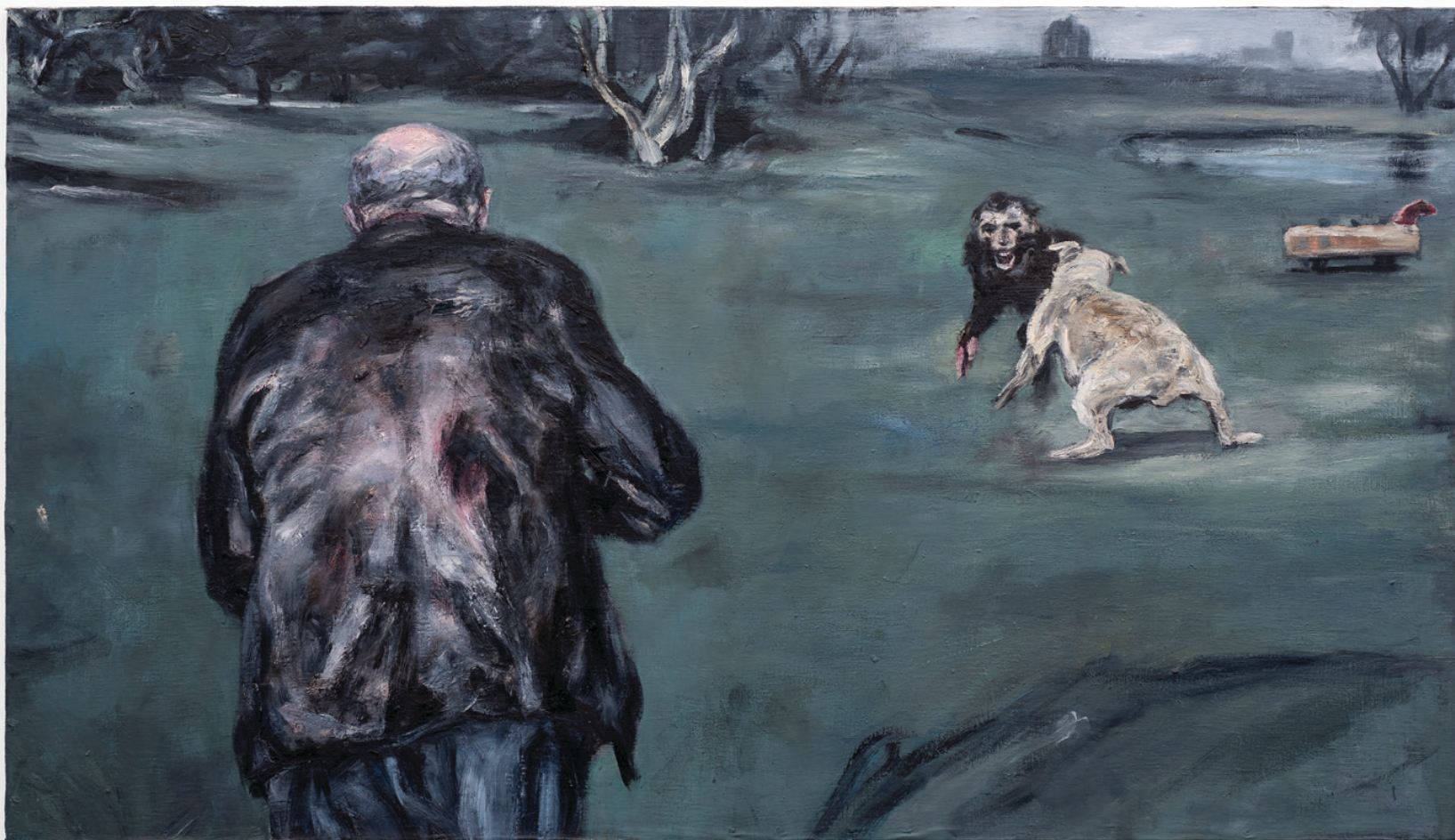
Johann Louw Poussin se oggendwandeling 2020 Oil on Canvas 122 x 212 cm