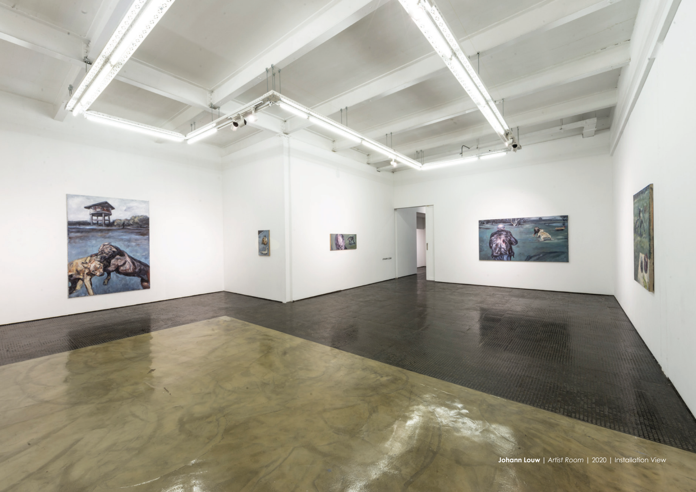
Johann Louw | Artist Room | 2020 | Installation View